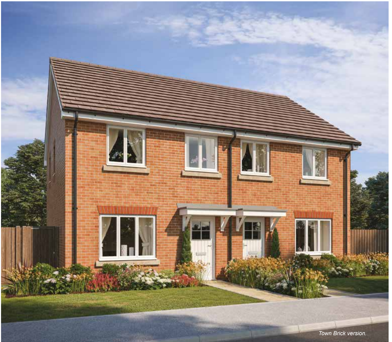
Town Brick version.