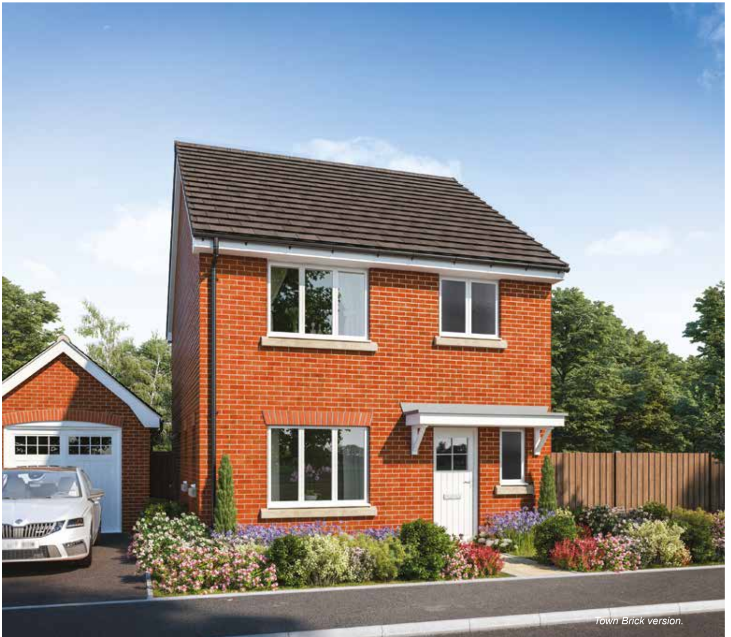
Town Brick version.