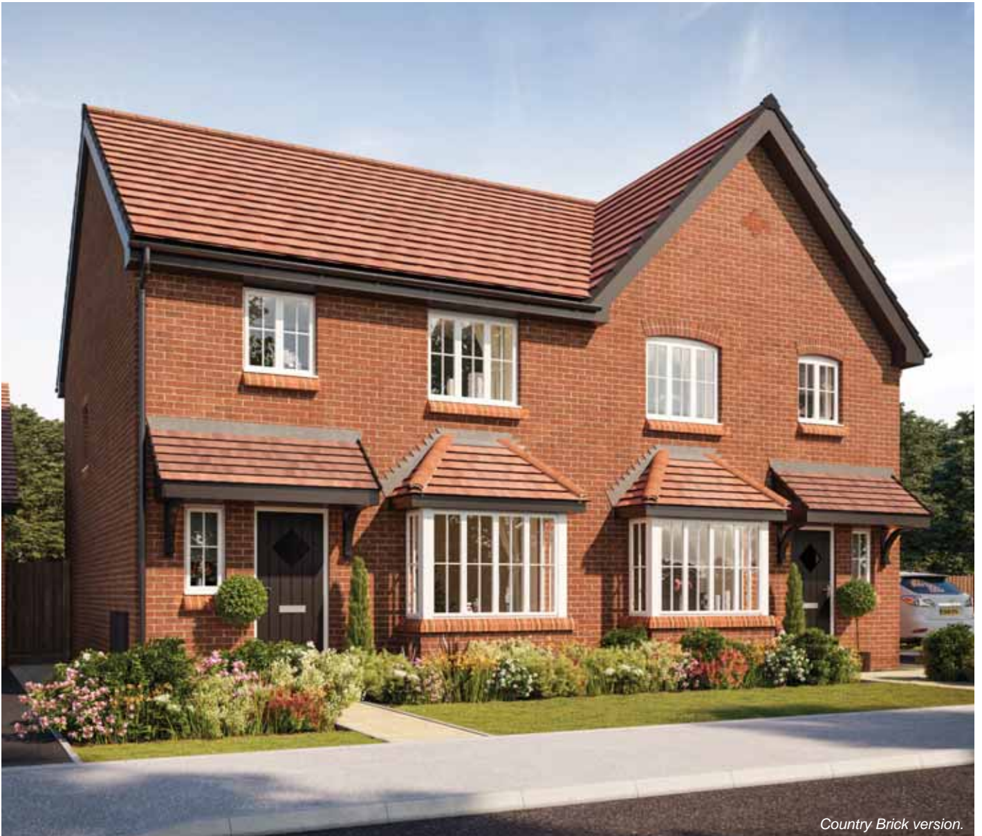
Country Brick version.