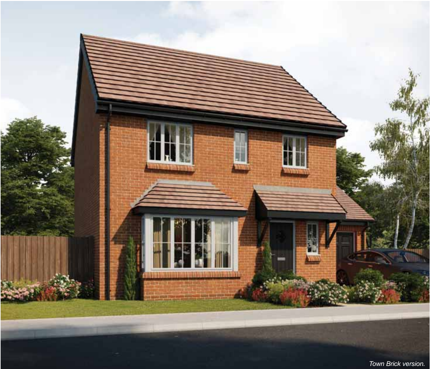
Town Brick version.