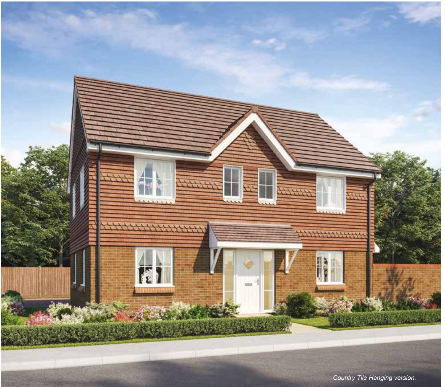
Country Tile Hanging version.