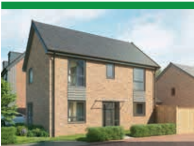
The Daisy 3 bedroom home Plots 82, 204, 220, 241, 250, 251 & 262