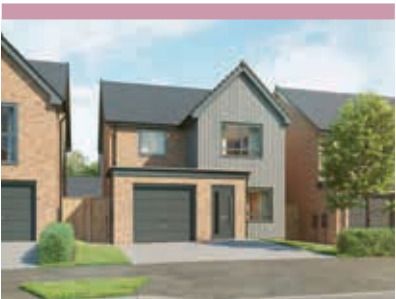
The Begonia 3 bedroom home Plots 169, 175, 193, 211, 249, 254 & 257