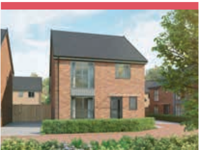
The Ophelia 4 bedroom home Plots 168, 178, 209, 210, 228 & 253