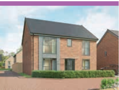
The Aster 4 bedroom home Plots 177, 215, 216, 217 & 265