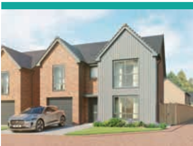
The Trillium 4 bedroom home Plots 170, 171, 173, 218, 219 & 264