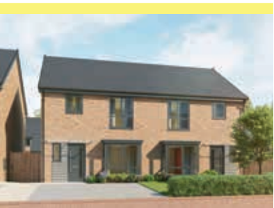
The Orchid 3 bedroom home Plots 207, 208, 242, 243, 244, 245, 246, 255, 256, 258, 259, 260, 261 & 263