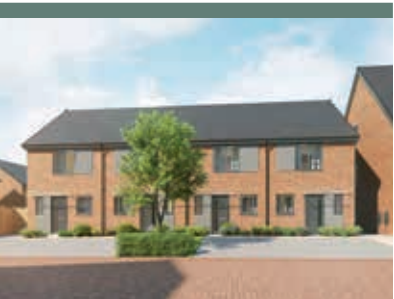
The Sundew 2 bedroom home Plots 205, 206, 247, 248 & 252