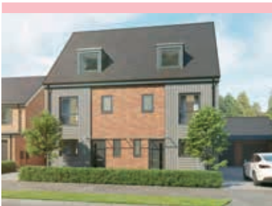
The Armeria 4 bedroom home Plots 78, 79, 80, 81, 194, 195, 196, 197, 200, 201, 202, 203, 229, 230, 231 & 232