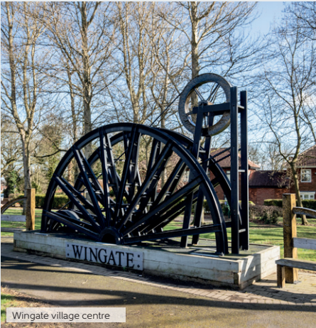
Wingate village centre

It will also appeal to growing families seeking more space and well-regarded schools, with the coastal pleasures and family activities of Seaham just a short drive away. The development is close to several amenities catering to everyday life, including a medical centre, post office and supermarket all within just two miles of home.