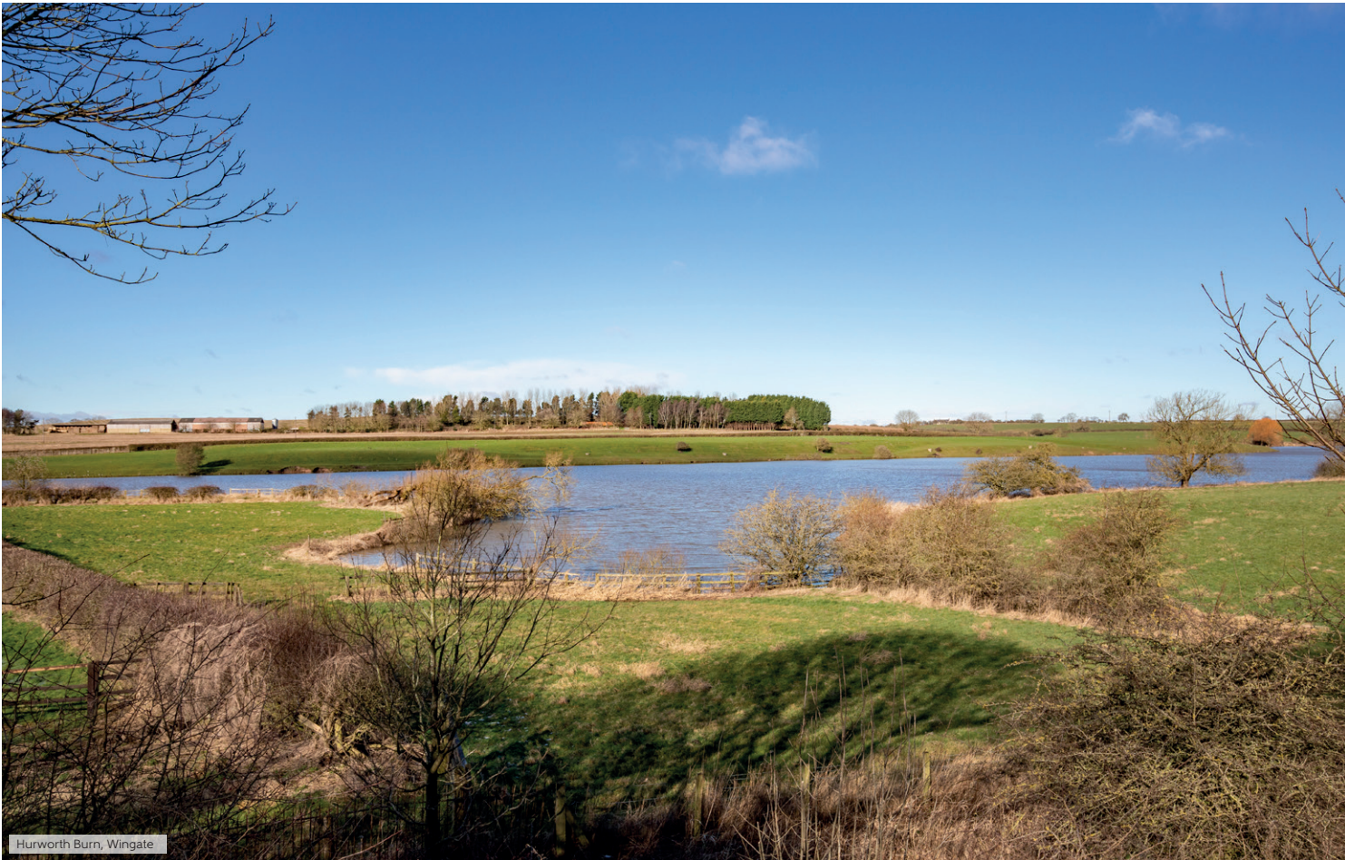
Hurworth Burn, Wingate