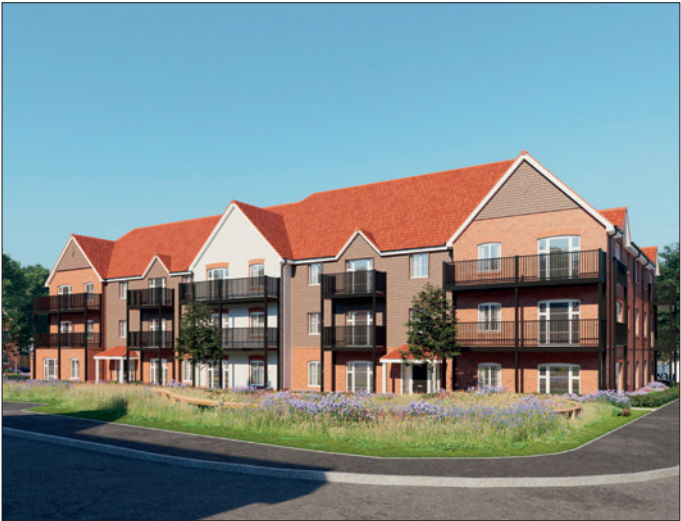
Vellum Plots 52, 54 & 56