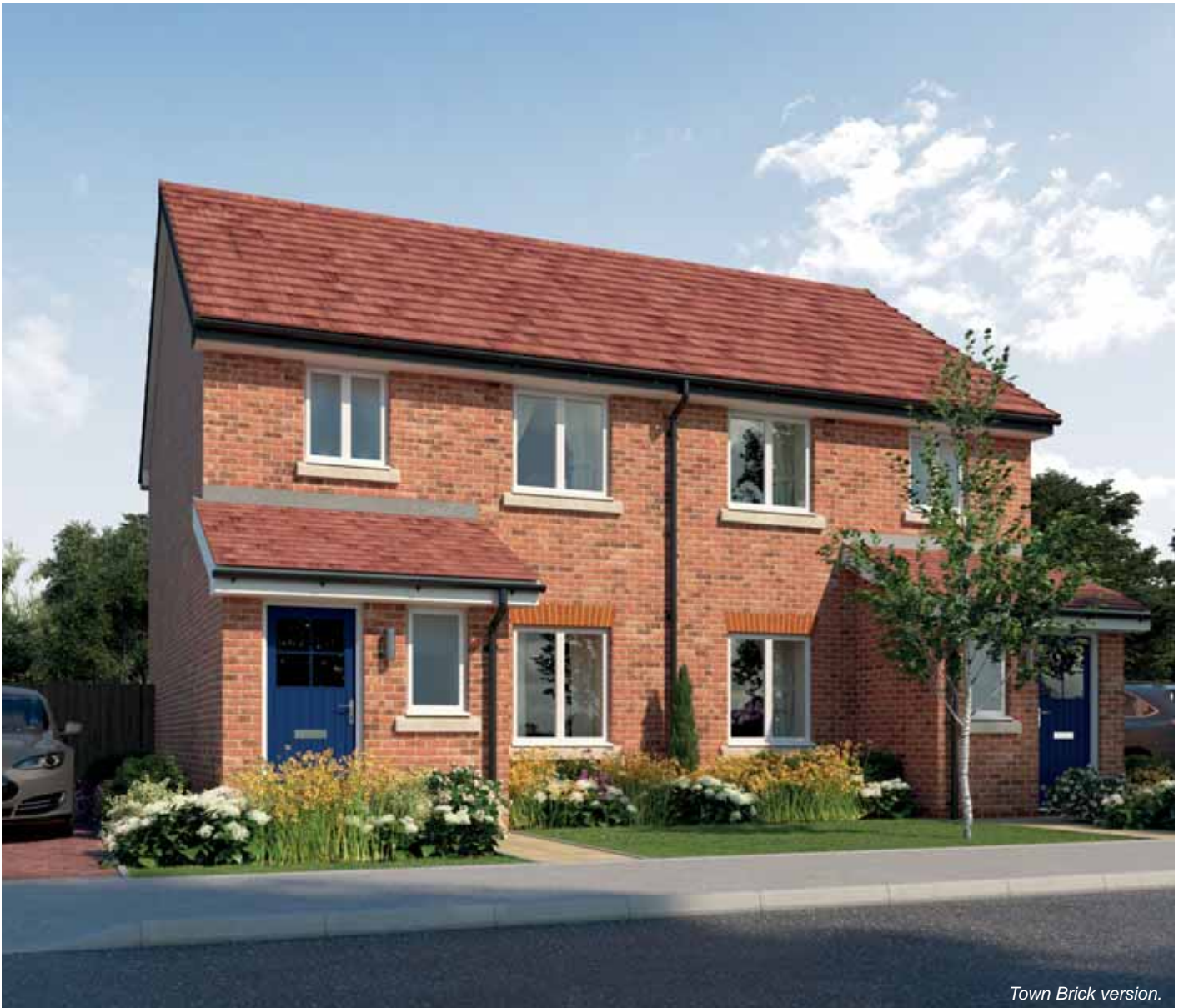
Town Brick version.