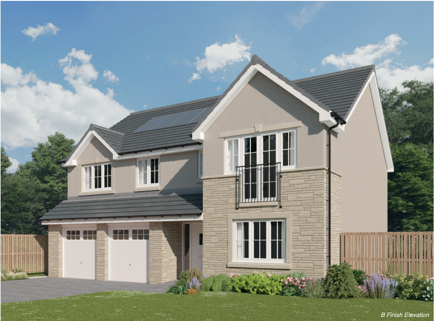
B Finish Elevation

FIVE BEDROOM DETACHED HOME WITH INTEGRAL DOUBLE GARAGE