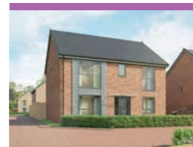
The Aster 4 bedroom home Plots 215, 216, 217 & 265