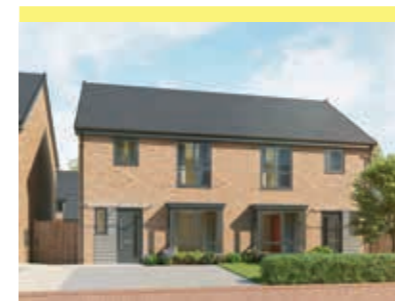
The Orchid 3 bedroom home Plots 207, 208, 242, 243, 244, 245, 246, 255, 256, 258, 259, 260, 261 & 263