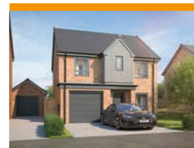
The Myrtle 4 bedroom home Plot 199