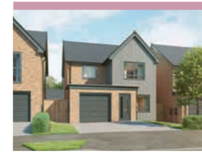
The Begonia 3 bedroom home Plots 211, 249, 254 & 257