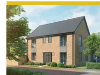
The Angelica 4 bedroom home Plots 77, 212, 213, 214, 233 & 266