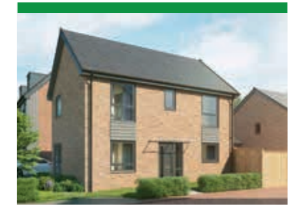
The Daisy 3 bedroom home Plots 82, 204, 220, 241, 250, 251 & 262