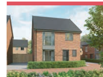
The Ophelia 4 bedroom home Plots 209, 210, 228 & 253