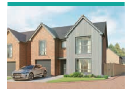
The Trillium 4 bedroom home Plots 218, 219 & 264