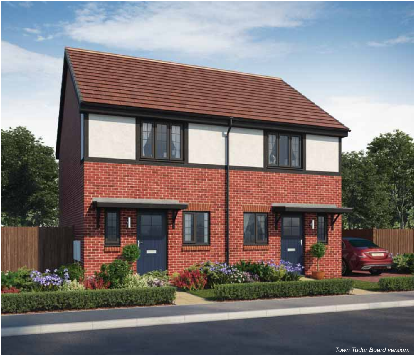
Town Tudor Board version.