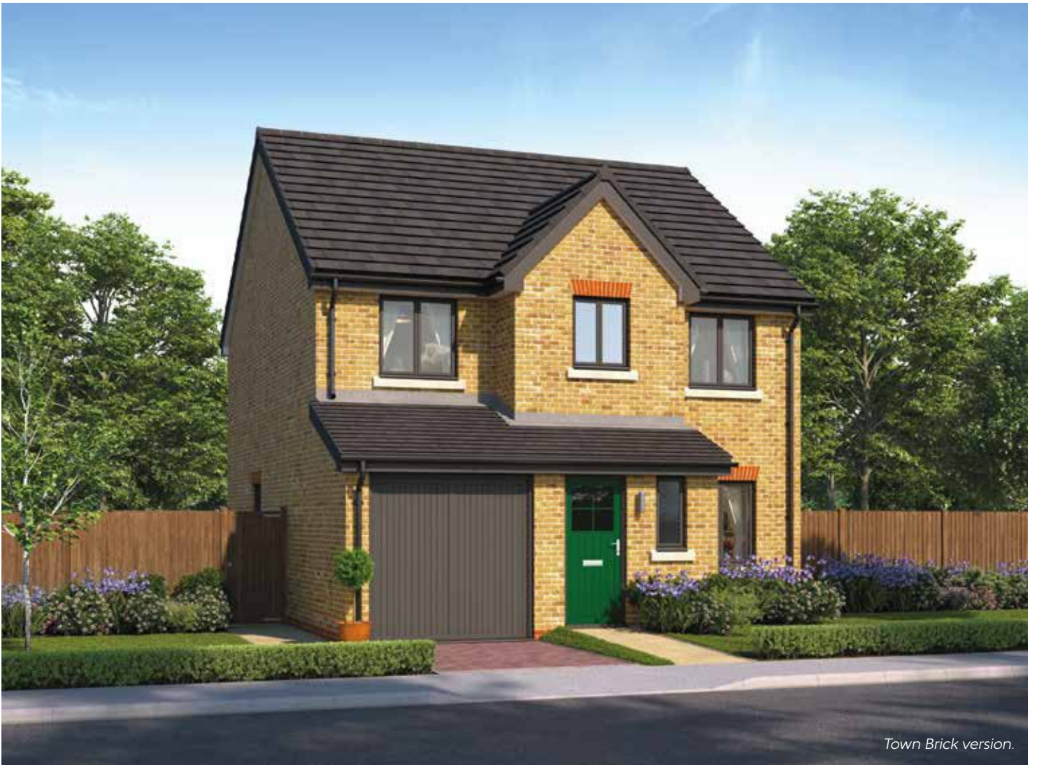
Town Brick version.