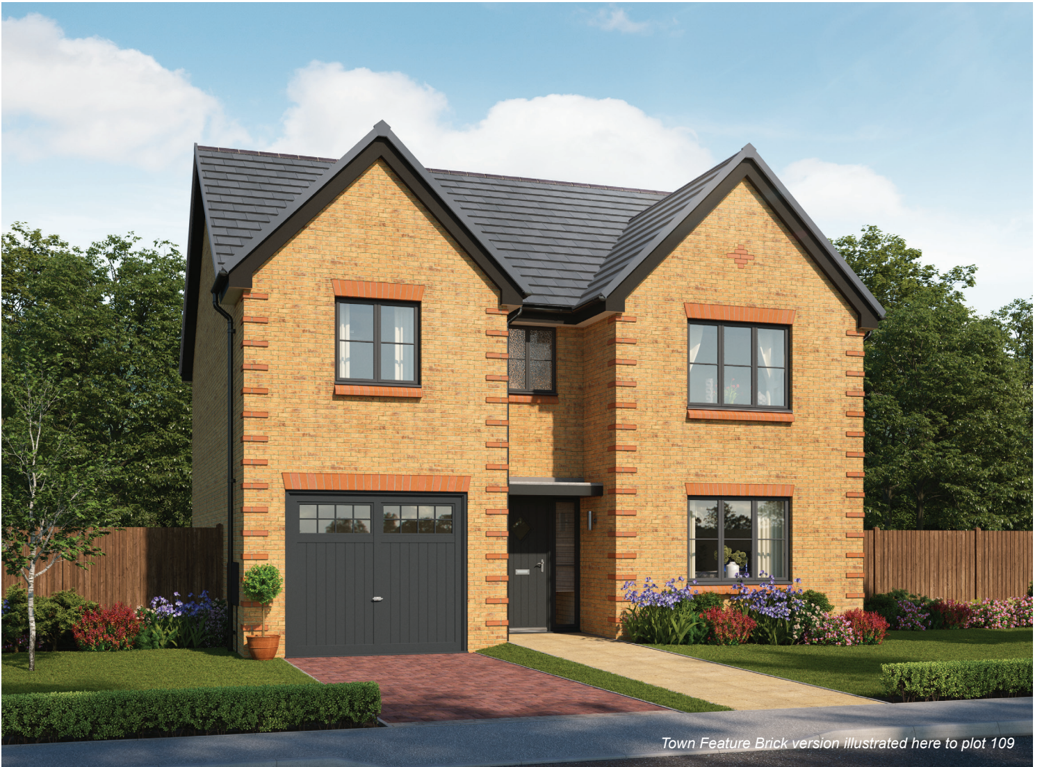
Town Feature Brick version illustrated here to plot 109