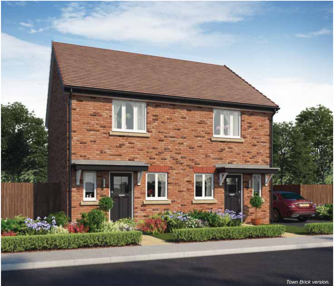
Town Brick version.