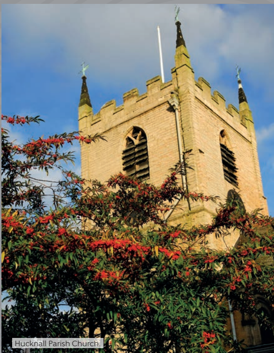
Hucknall Parish Church.

For indoor leisure, the local art-deco cinema shows all the latest blockbusters, while the Kangaroo Trampoline Park provides the perfect place for the kids to let off steam. However, if you prefer to be out in the fresh air, there are also plenty of local options for you.