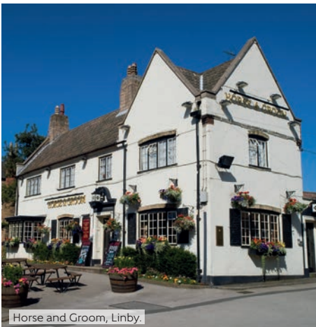
Horse and Groom, Linby.

family, a commuting professional or you're looking to downsize to somewhere more convenient, Abbey Fields Grange will appeal to you. Each home boasts light and versatile interior space, off-road parking or garage, great transport connections and well-regarded local schools, all in a location just six miles from Nottingham city centre.