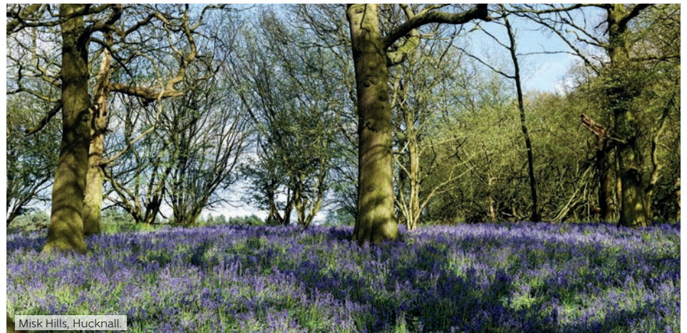
Misk Hills, Hucknall.