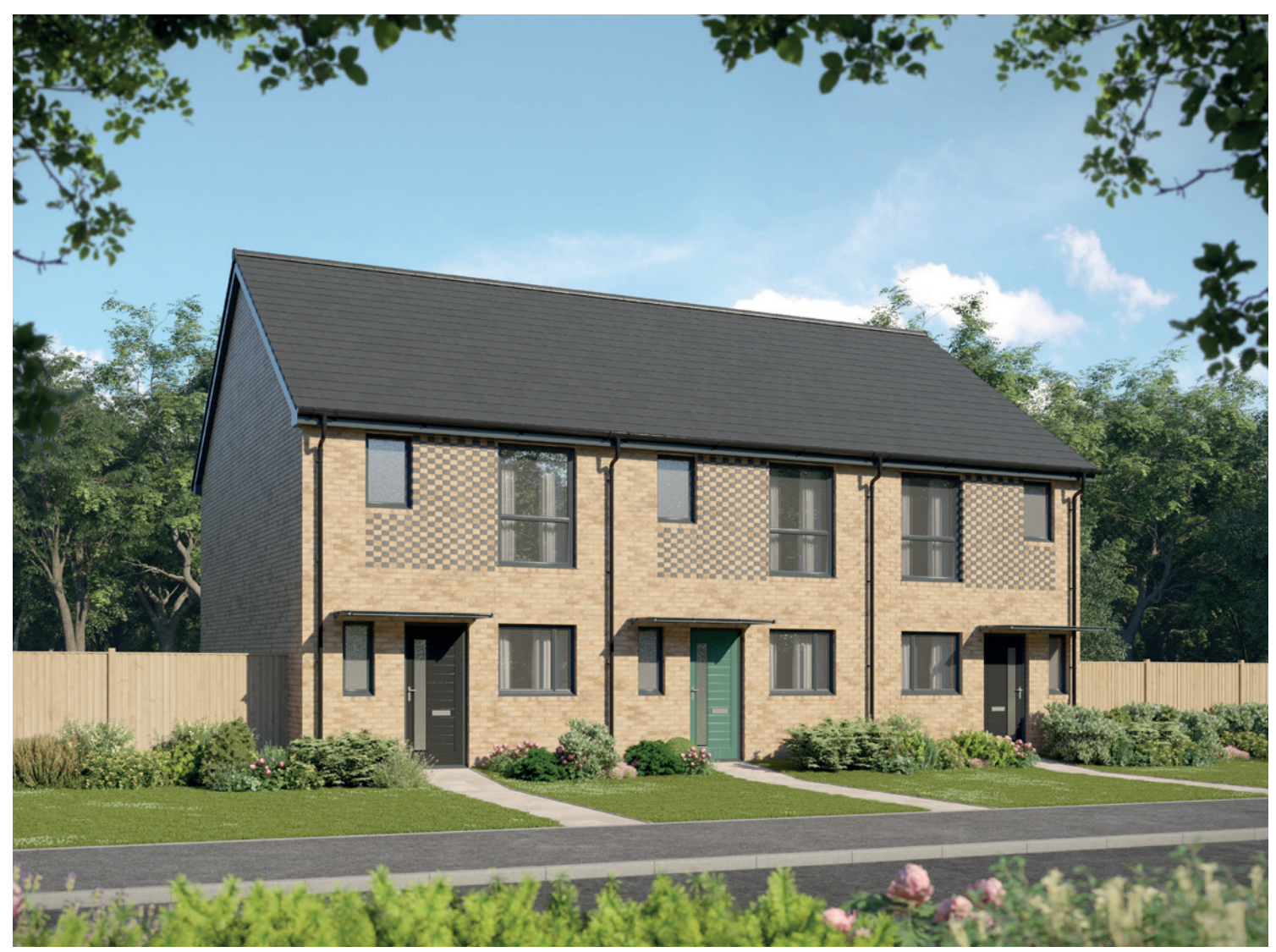
CGI illustrative of plots 167-169. Please see Sales Advisor for details of your chosen plot.