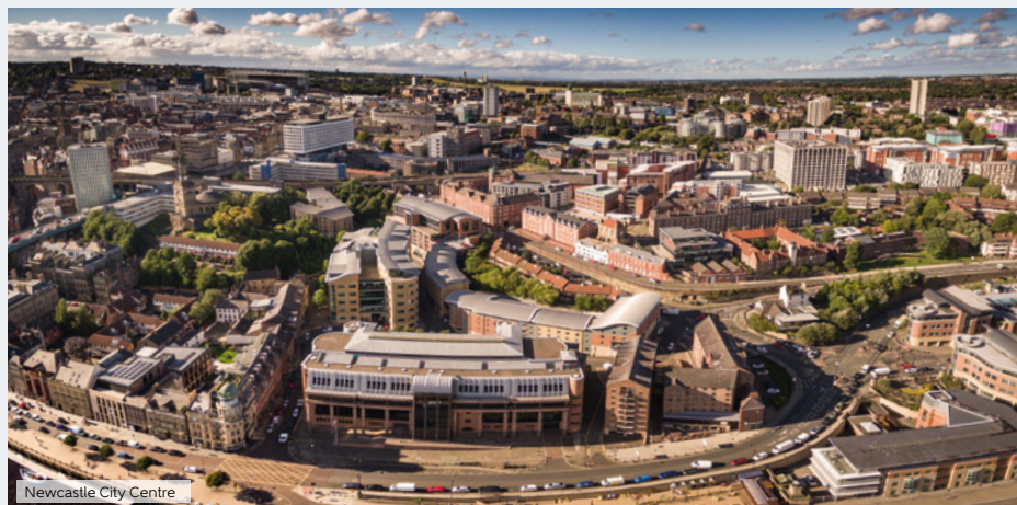
Newcastle City Centre