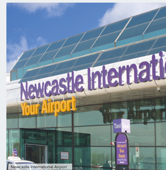
Newcastle International Airport

Close proximity to the A1 and A19 make travel easy, putting Morpeth Station eight minutes away. From here you can connect with Cramlington, Newcastle, Durham and Edinburgh. Alternatively, Newcastle International Airport can be reached in 16 minutes by car.