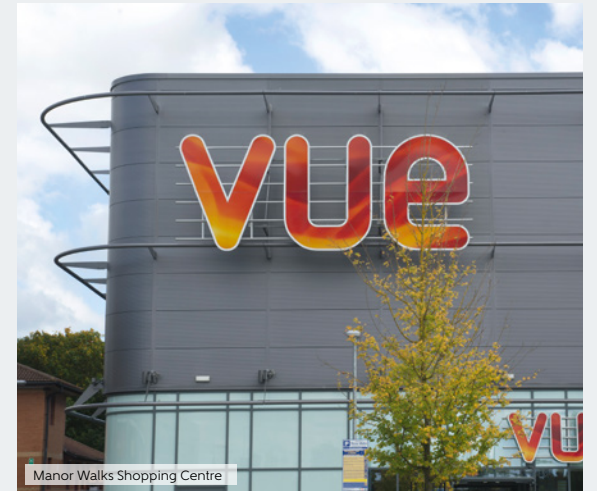
Manor Walks Shopping Centre

Alternatively, an 11-minute drive south-east will take you to Manor Walks Shopping and Leisure Centre in Cramlington. Here you'll find shops, cafés, restaurants and a multi-screen cinema. There is also an extensive leisure centre featuring a pleasure pool, climbing wall, soft play and spa facilities, along with the usual gym, sports courts and fitness classes.