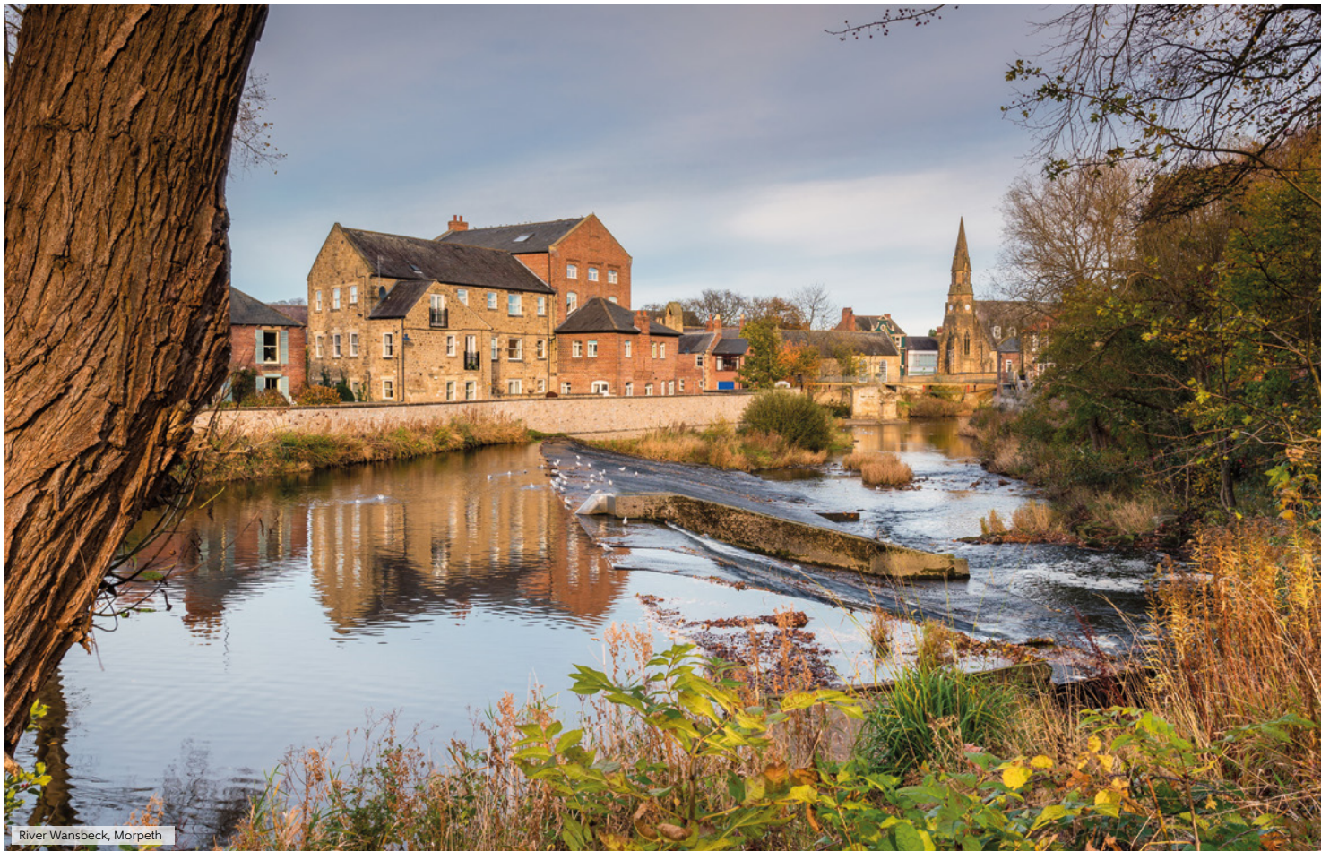
River Wansbeck, Morpeth