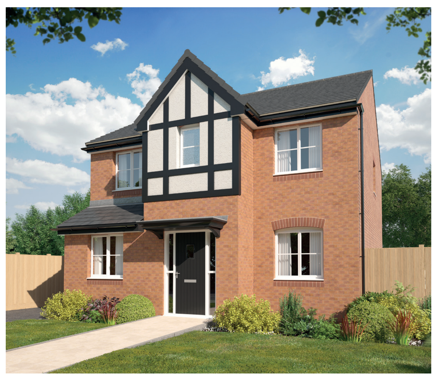
Please note: Plots 1, 106, 137 & 138 will be built with black windows.

Bellway Homes Limited (North West), 2 Alderman Road, Liverpool L24 9LR