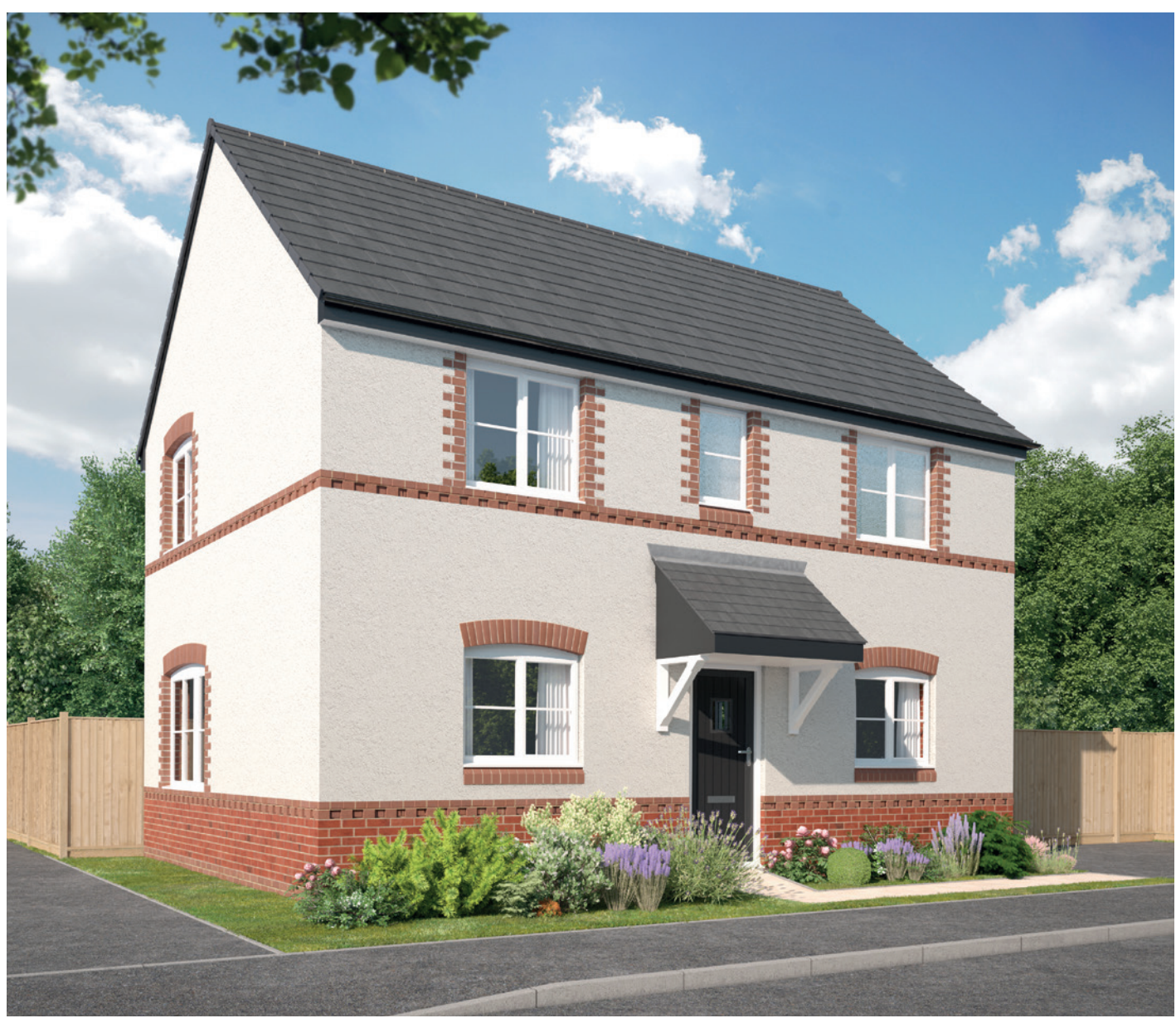
Please note: Plots 14, 15, 16, 38, 39, 41, 44, 55, 68, 73, 105 & 136 will be built with black windows.

Bellway Homes Limited (North West), 2 Alderman Road, Liverpool L24 9LR