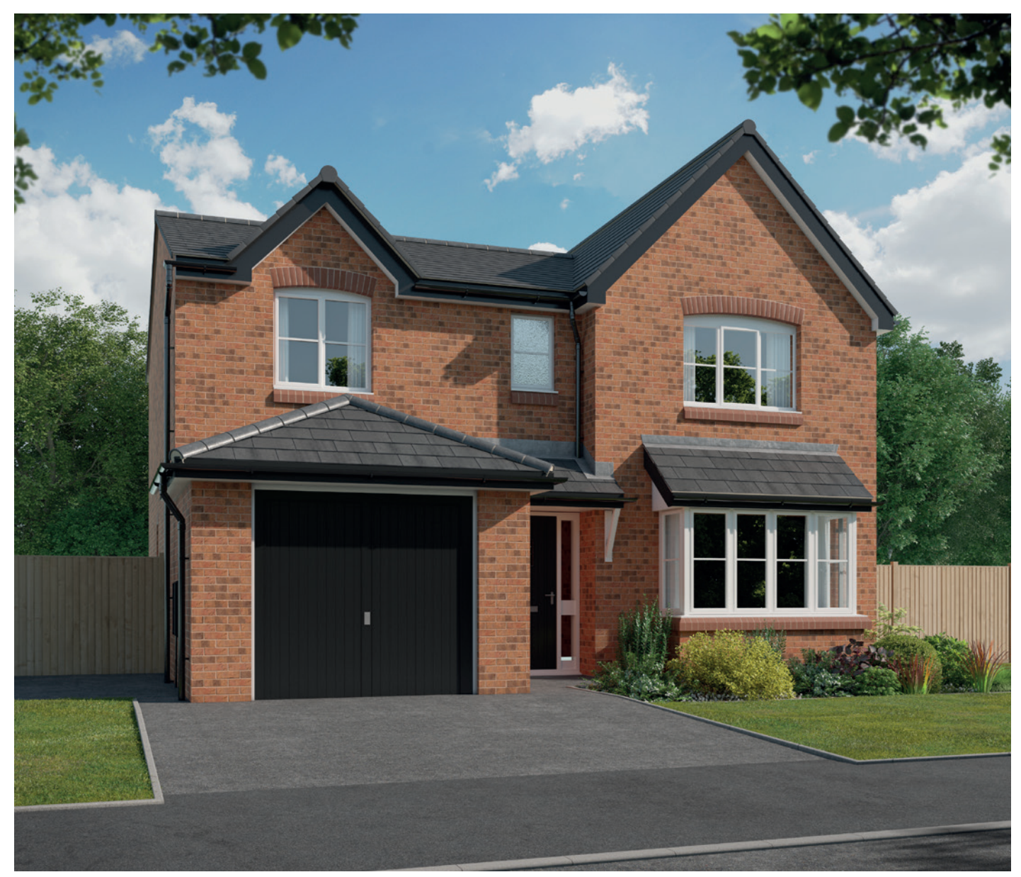
Please note: Plots 40, 42 & 43 will be built with black windows.

Bellway Homes Limited (North West), 2 Alderman Road, Liverpool L24 9LR