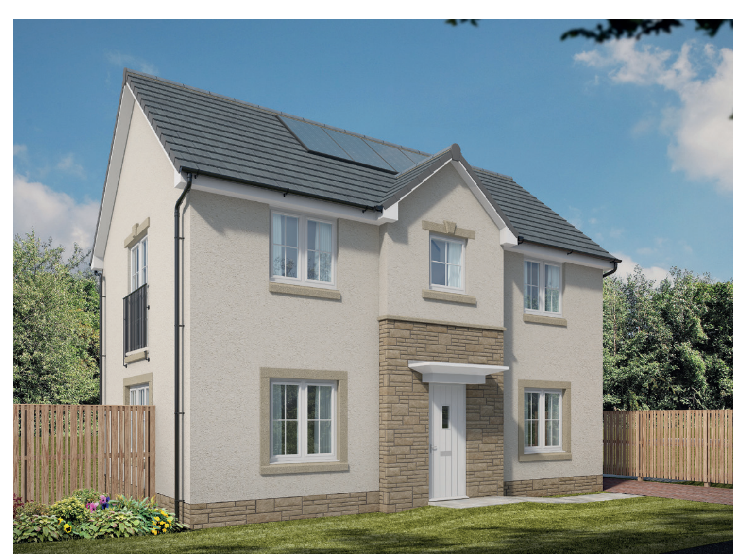
Please note Photo Voltaic (solar) panels shown above are indicative only. The location and number of panels are dependent on plot orientation. Please see Sales Advisor for details.