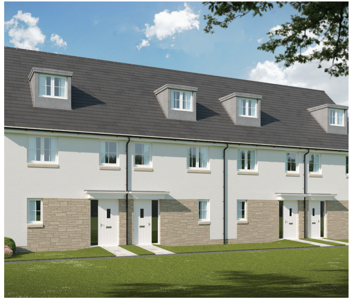
Please note Photo Voltaic (solar) panels shown above are indicative only. The location and number of panels are dependent on plot orientation. Please see Sales Advisor for details.

Bellway Homes Limited (Scotland) Bothwell House, Hamilton Business Park Caird Street, Hamilton ML3 0QA