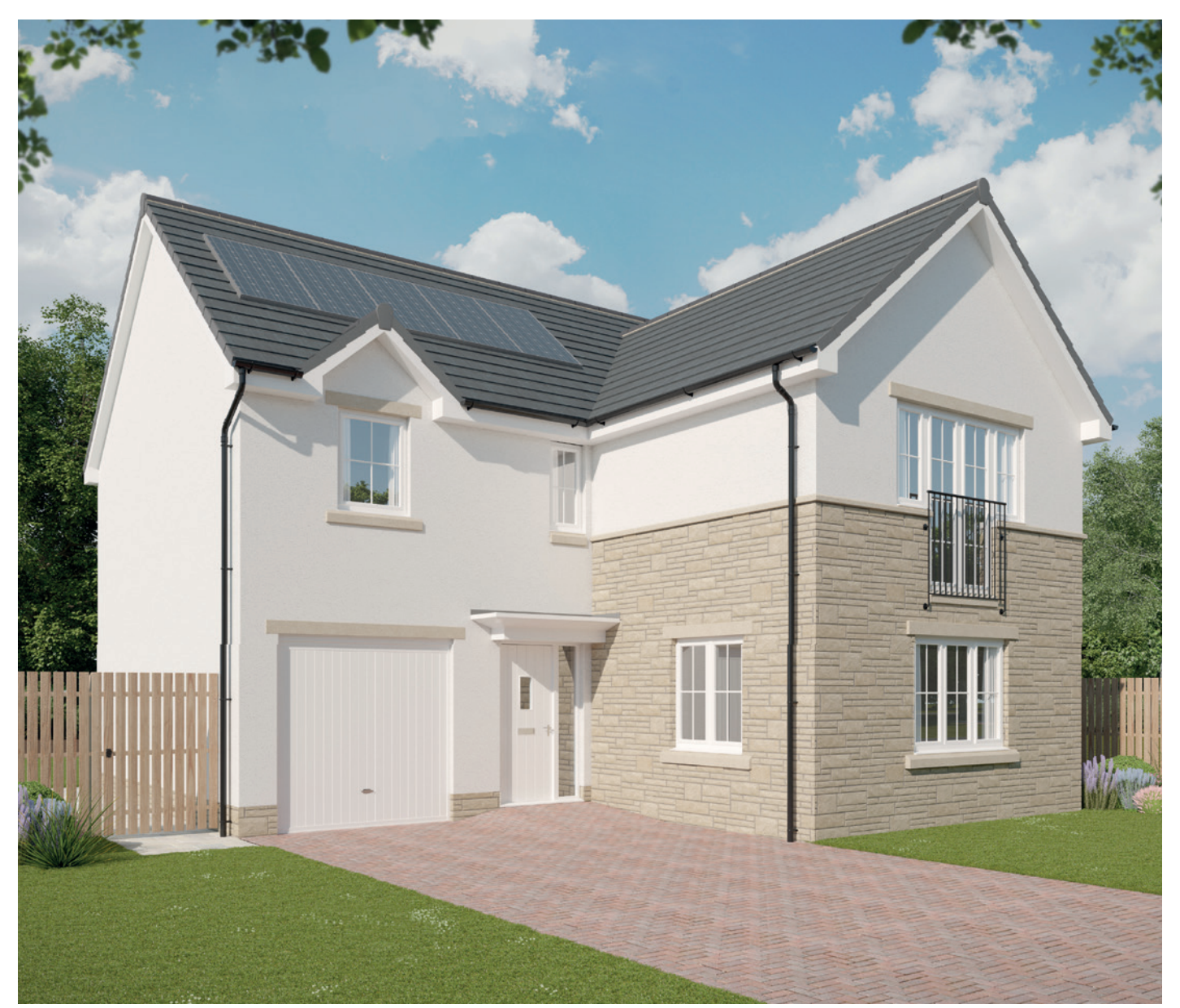
Please \ note \ Photo \ Voltaic \ (solar) \ panels \ shown \ above \ are \ indicative \ only. \ The \ location \ and \ number \ of \ panels \ are \ dependent \ on \ plot \ orientation. \ Please \ see \ Sales \ Advisor \ for \ details.

Bellway Homes Limited (Scotland) Bothwell House, Hamilton Business Park Caird Street, Hamilton ML3 0QA