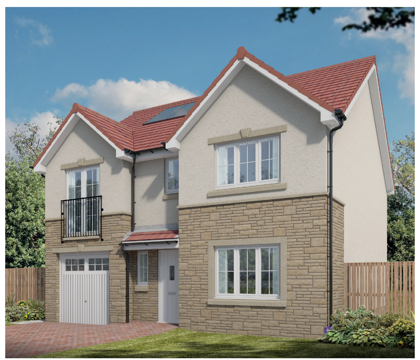
Please \ note \ Photo \ Voltaic \ (solar) \ panels \ shown \ above \ are \ indicative \ only. \ The \ location \ and \ number \ of \ panels \ are \ dependent \ on \ plot \ orientation. \ Please \ see \ Sales \ Advisor \ for \ details.

Bellway Homes Limited (Scotland) Bothwell House, Hamilton Business Park Caird Street, Hamilton ML3 0QA