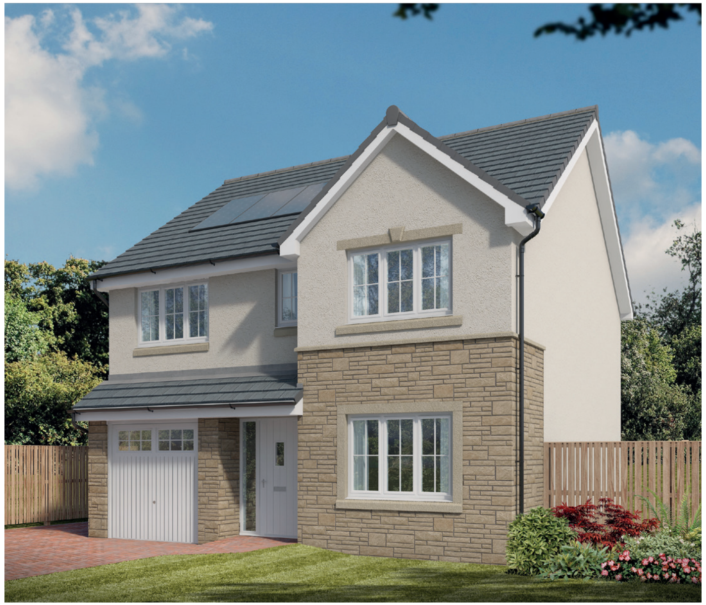
Please \ note \ Photo \ Voltaic \ (solar) \ panels \ shown \ above \ are \ indicative \ only. \ The \ location \ and \ number \ of \ panels \ are \ dependent \ on \ plot \ orientation. \ Please \ see \ Sales \ Advisor \ for \ details \ details \ dependent \ on \ plot \ orientation.

Bellway Homes Limited (Scotland) Bothwell House, Hamilton Business Park Caird Street, Hamilton ML3 0QA