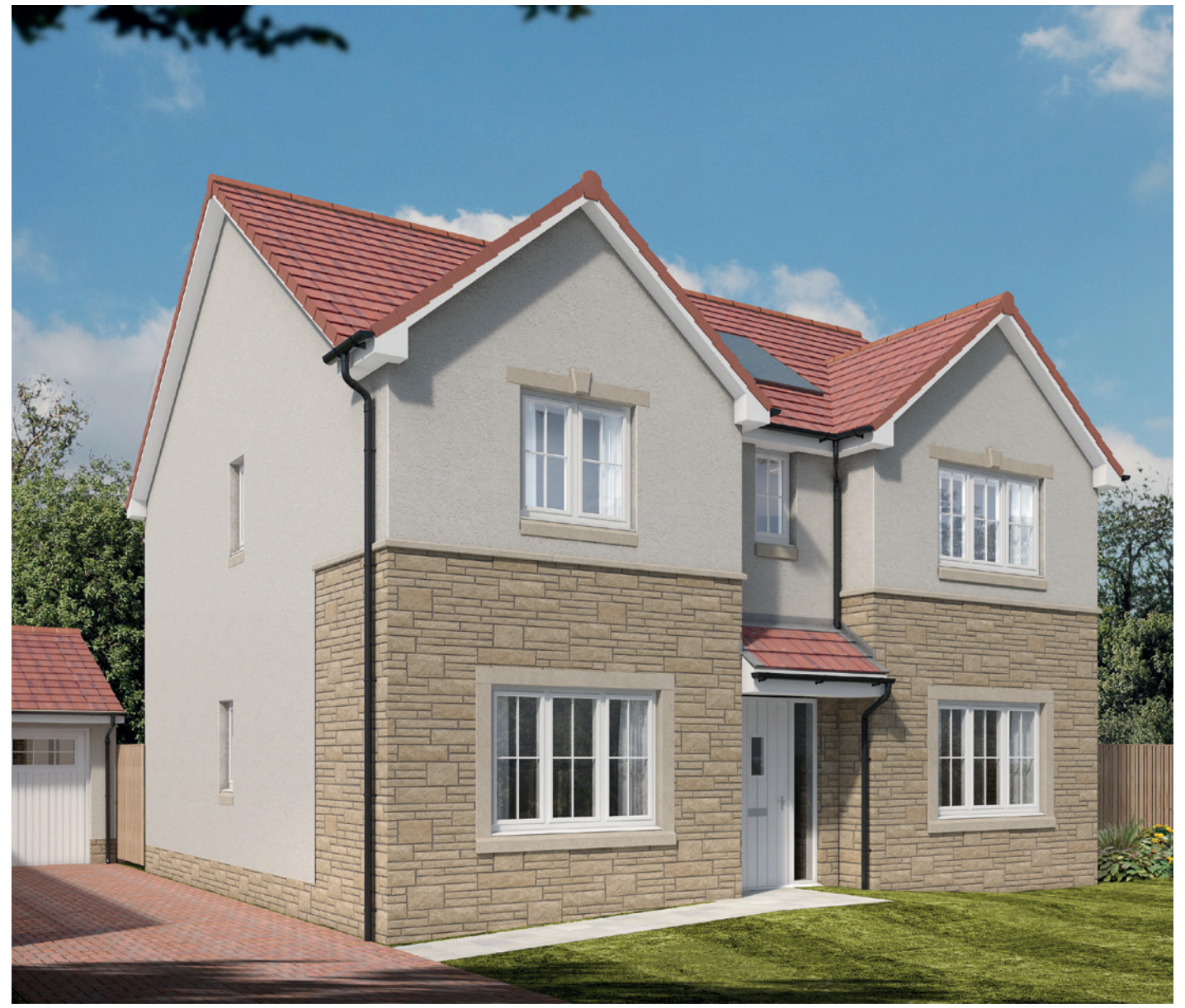
Please note Photo Voltaic (solar) panels shown above are indicative only. The location and number of panels are dependent on plot orientation. Please see Sales Advisor for details.

Bellway Homes Limited (Scotland) Bothwell House, Hamilton Business Park Caird Street, Hamilton ML3 0QA