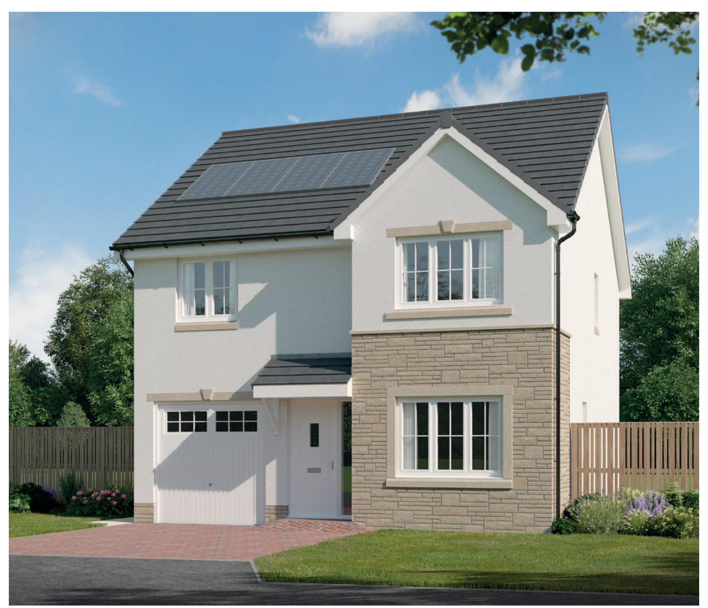
Please \ note \ Photo \ Voltaic \ (solar) \ panels \ shown \ above \ are \ indicative \ only. \ The \ location \ and \ number \ of \ panels \ are \ dependent \ on \ plot \ orientation. \ Please \ see \ Sales \ Advisor \ for \ details \ details \ dependent \ on \ plot \ orientation.

Bellway Homes Limited (Scotland) Bothwell House, Hamilton Business Park Caird Street, Hamilton ML3 0QA