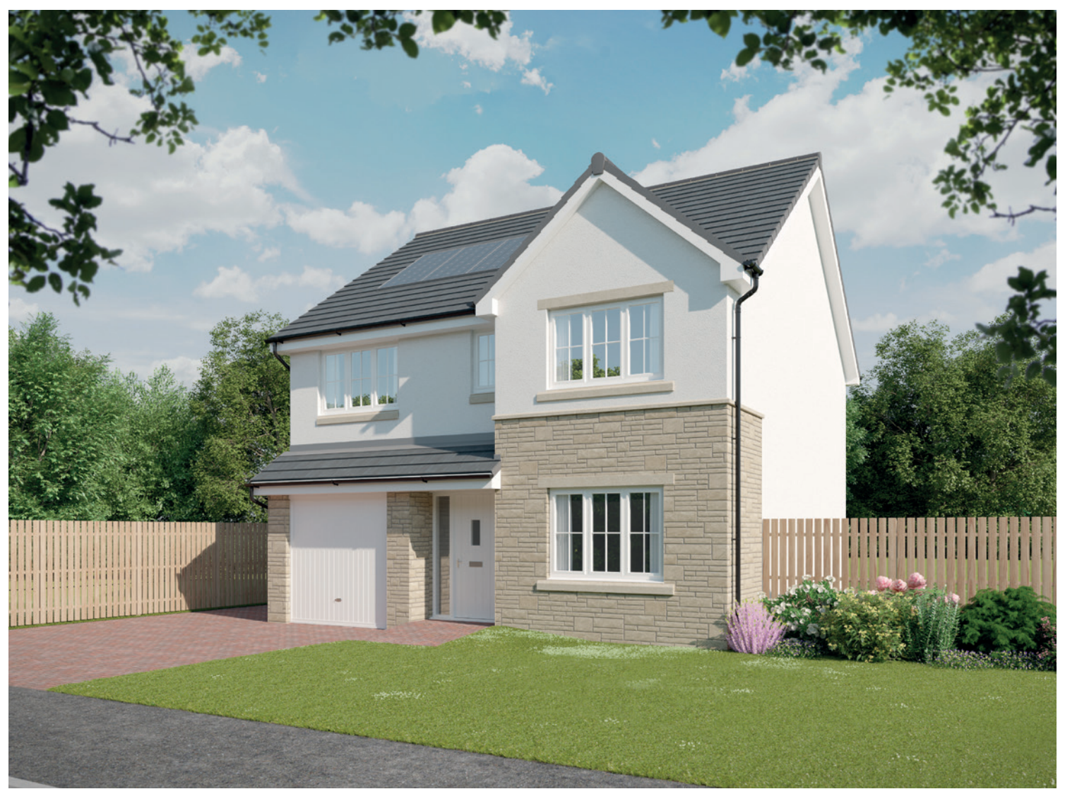
Please note Photo Voltaic (solar) panels shown above are indicative only. The location and number of panels are dependent on plot orientation. Please see Sales Advisor for details.

FOUR BEDROOM DETACHED HOME WITH INTEGRAL GARAGE