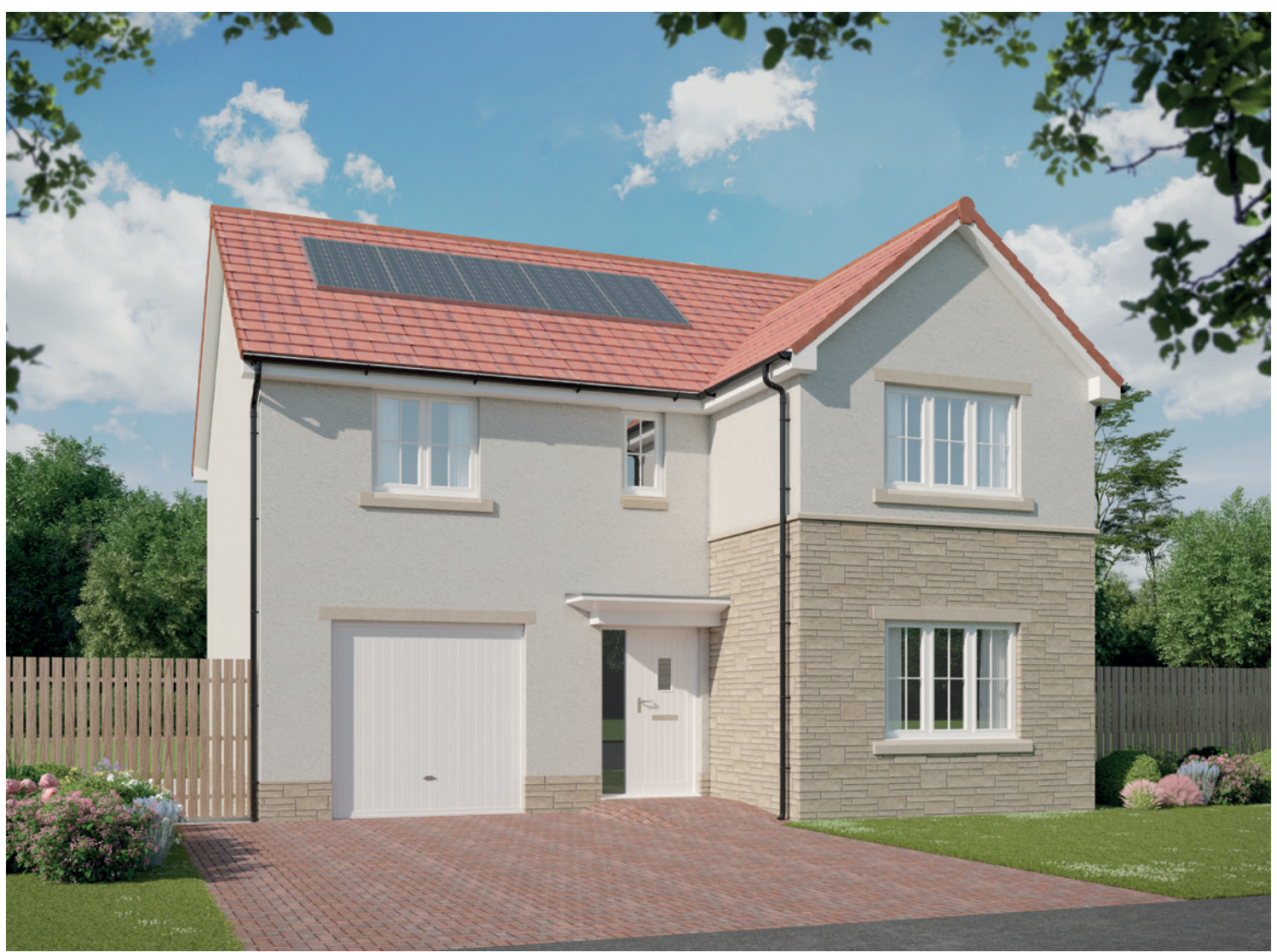
Please note Photo Voltaic (solar) panels shown above are indicative only. The location and number of panels are dependent on plot orientation. Please see Sales Advisor for details.

FOUR BEDROOM DETACHED HOME WITH INTEGRAL GARAGE