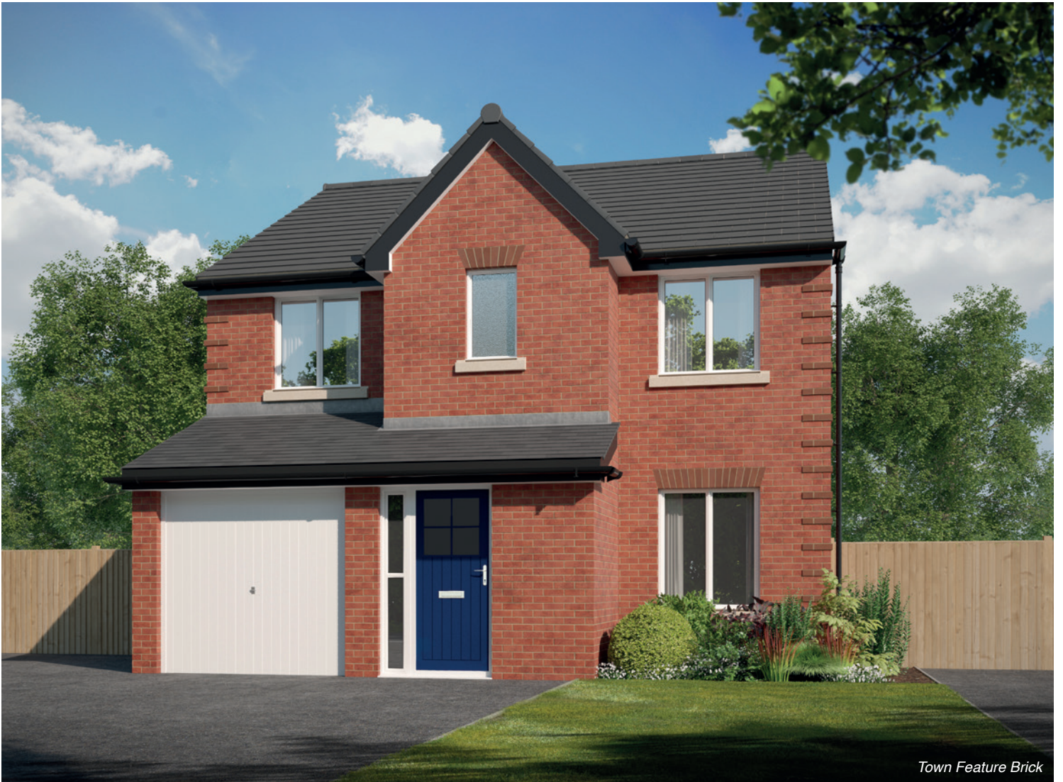
Town Feature Brick