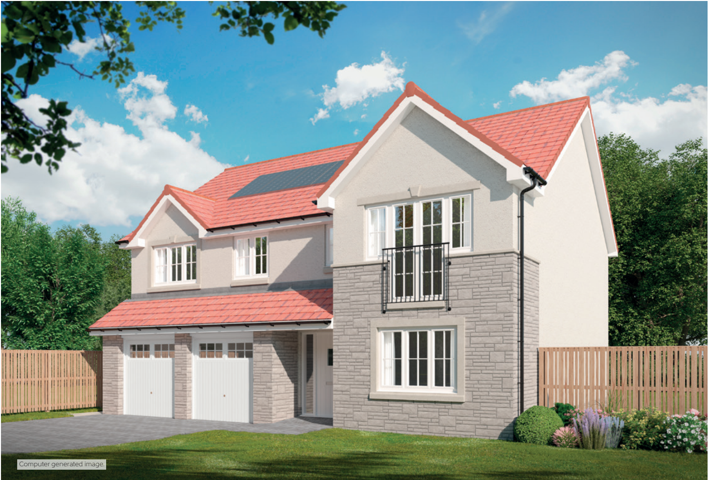
Computer generated image.