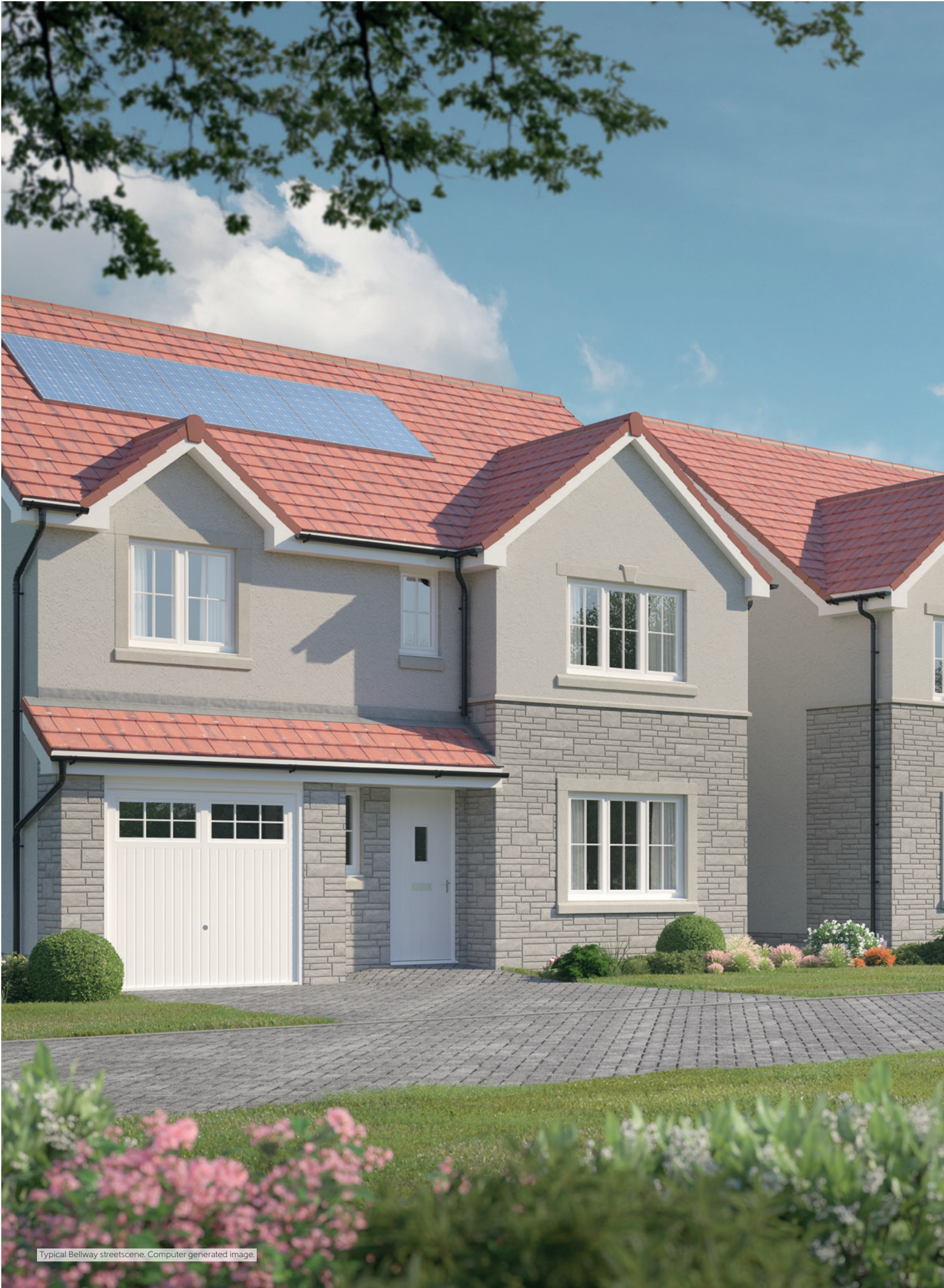
Typical Bellway streetscene. Computer generated image.