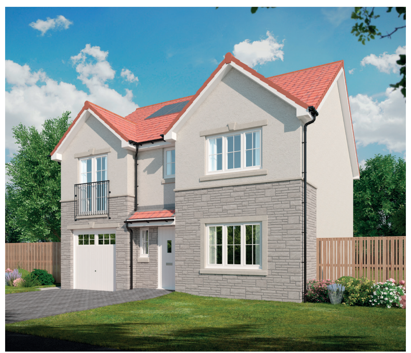
Please note Photo Voltaic (solar) panels shown above are indicative only. The location and number of panels are dependent on plot orientation. Please see Sales Advisor for details.

Bellway Homes Limited (Scotland East) 6 Almondvale Business Park, Almondvale Way Livingston, West Lothian, EH54 6GA