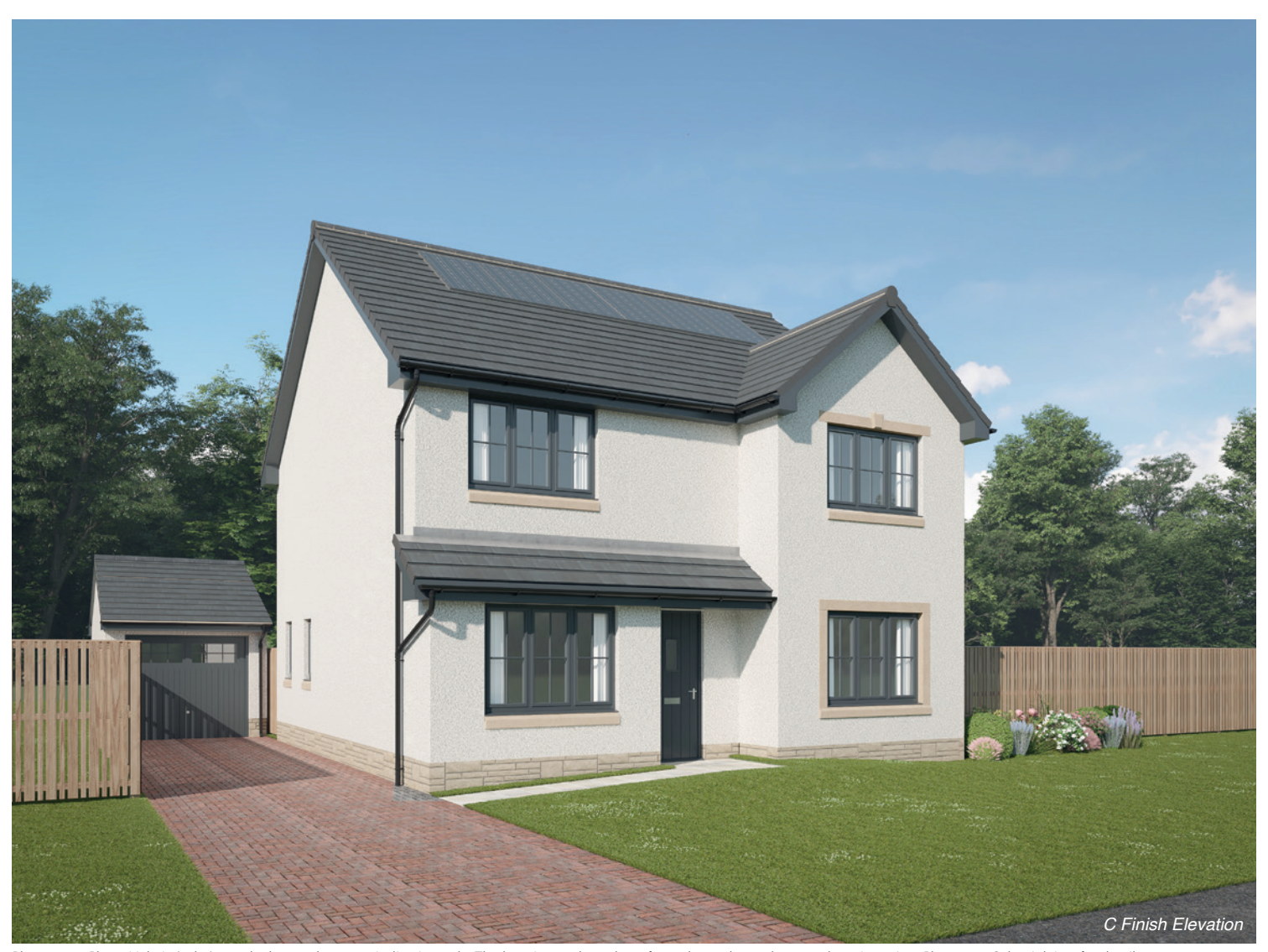
Please note Photo Voltaic (solar) panels shown above are indicative only. The location and number of panels are dependent on plot orientation. Please see Sales Advisor for details.

FOUR BEDROOM DETACHED HOME WITH DETACHED GARAGE