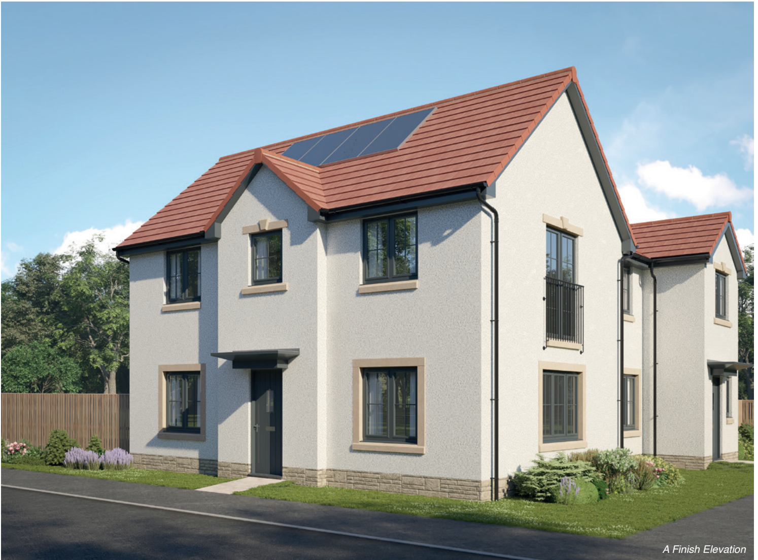
A Finish Elevation

Please note Photo Voltaic (solar) panels shown above are indicative only. The location and number of panels are dependent on plot orientation. Please see Sales Advisor for details.