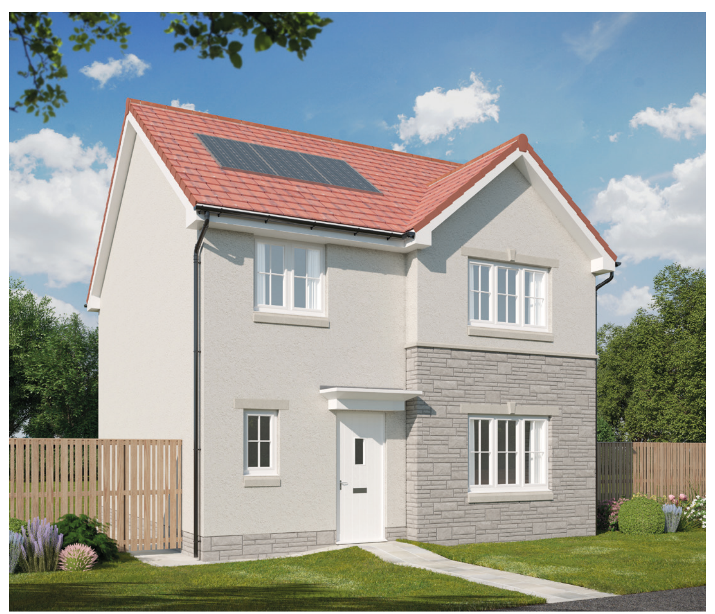
Please note Photo Voltaic (solar) panels shown above are indicative only. The location and number of panels are dependent on plot orientation. Please see Sales Advisor for details.

Bellway Homes Limited (Scotland East) 6 Almondvale Business Park, Almondvale Way Livingston, West Lothian, EH54 6GA