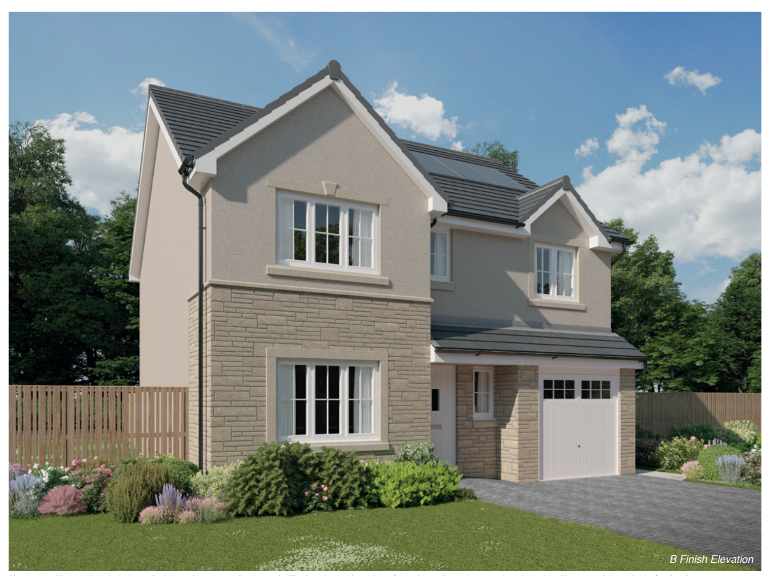
Please note Photo Voltaic (solar) panels shown above are indicative only. The location and number of panels are dependent on plot orientation. Please see Sales Advisor for details.

FOUR BEDROOM DETACHED HOME WITH INTEGRAL GARAGE