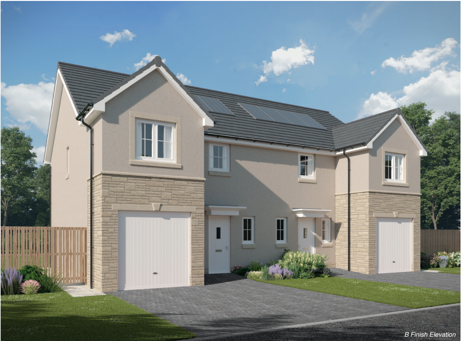
B Finish Elevation

Please note Photo Voltaic (solar) panels shown above are indicative only. The location and number of panels are dependent on plot orientation. Please see Sales Advisor for details.