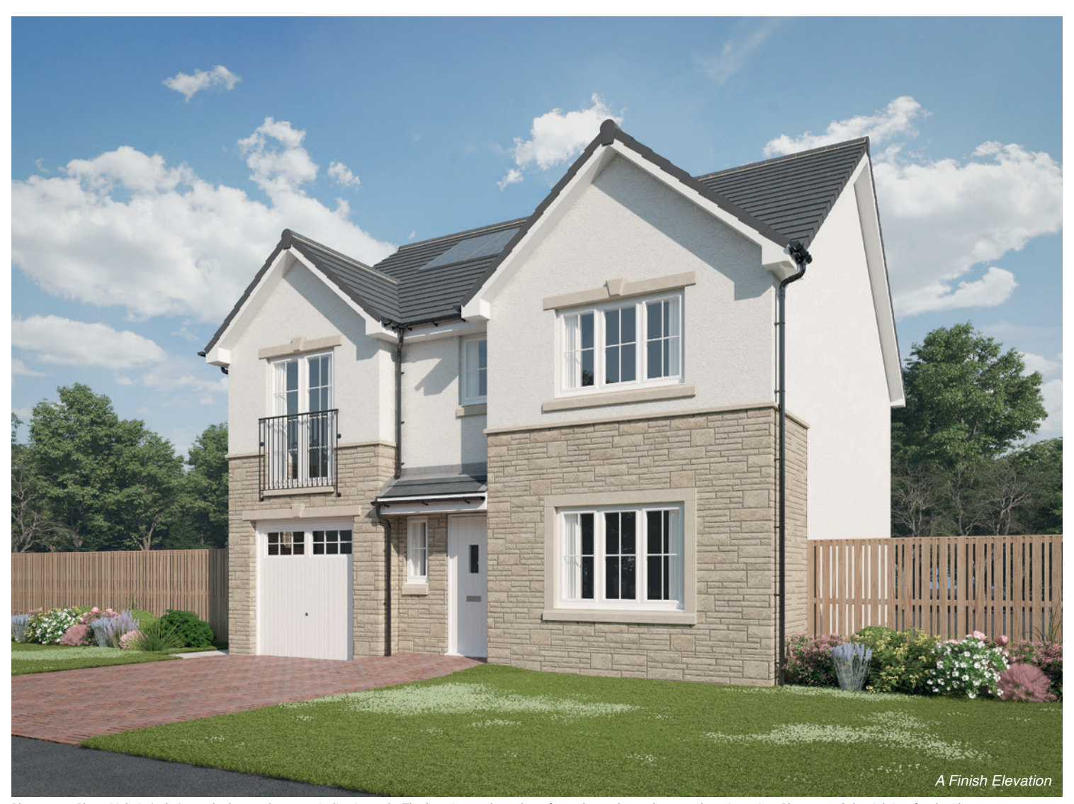
Please note Photo Voltaic (solar) panels shown above are indicative only. The location and number of panels are dependent on plot orientation. Please see Sales Advisor for details.

FOUR BEDROOM DETACHED HOME WITH DETACHED GARAGE