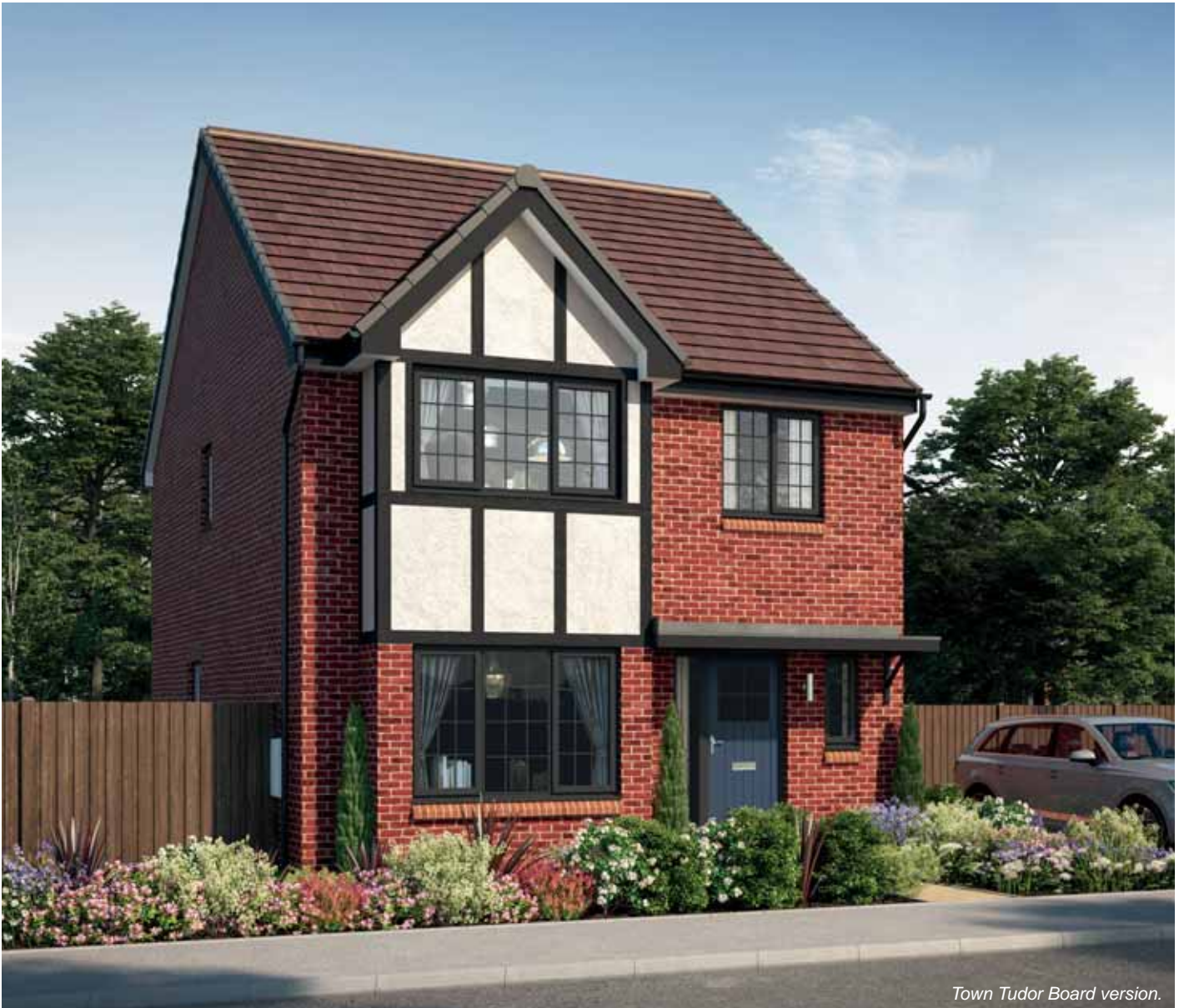
Town Tudor Board version.