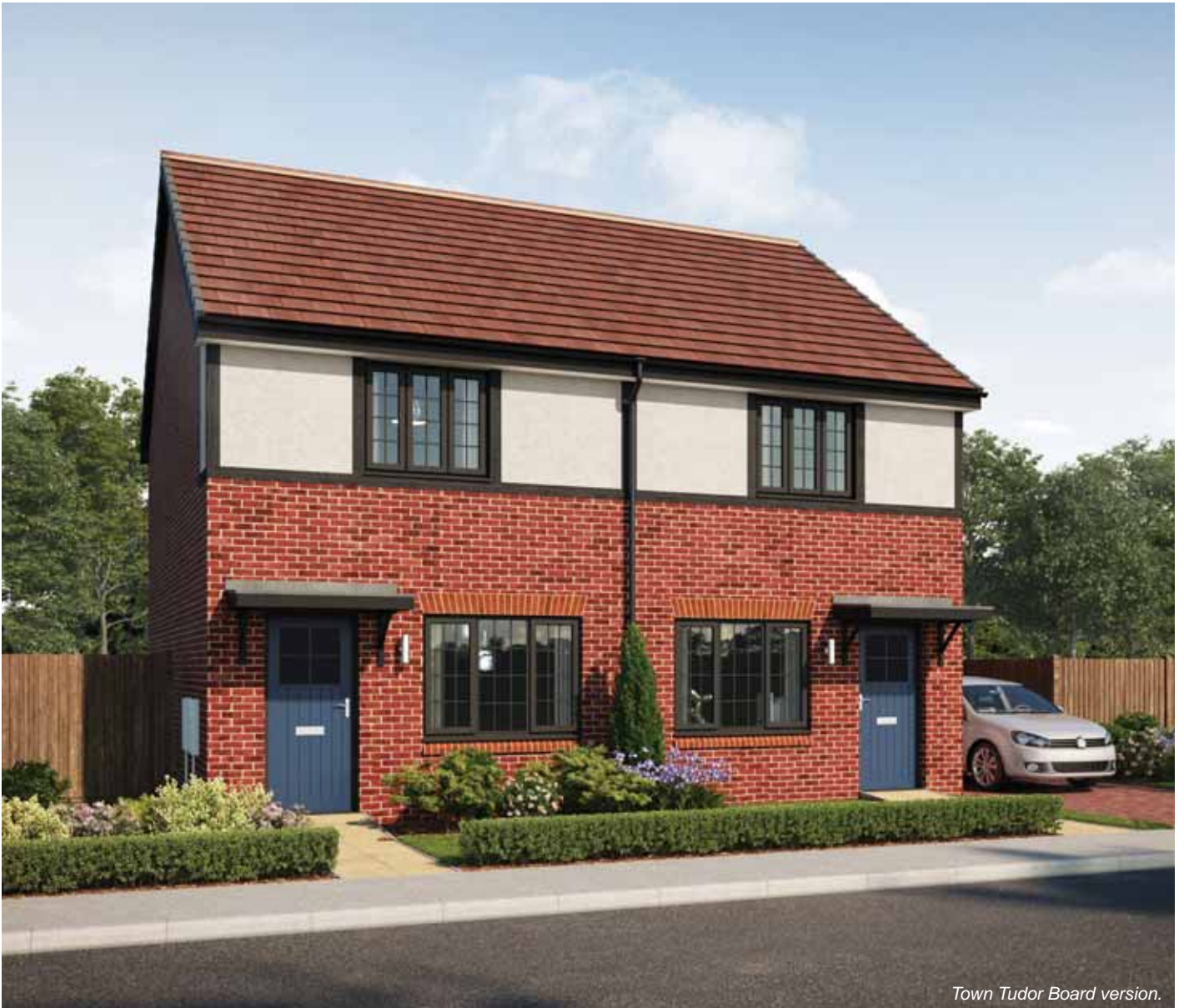
Town Tudor Board version.