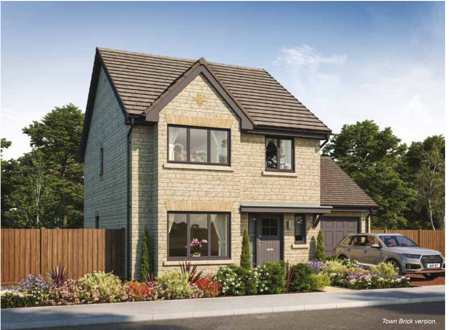
Town Brick version.