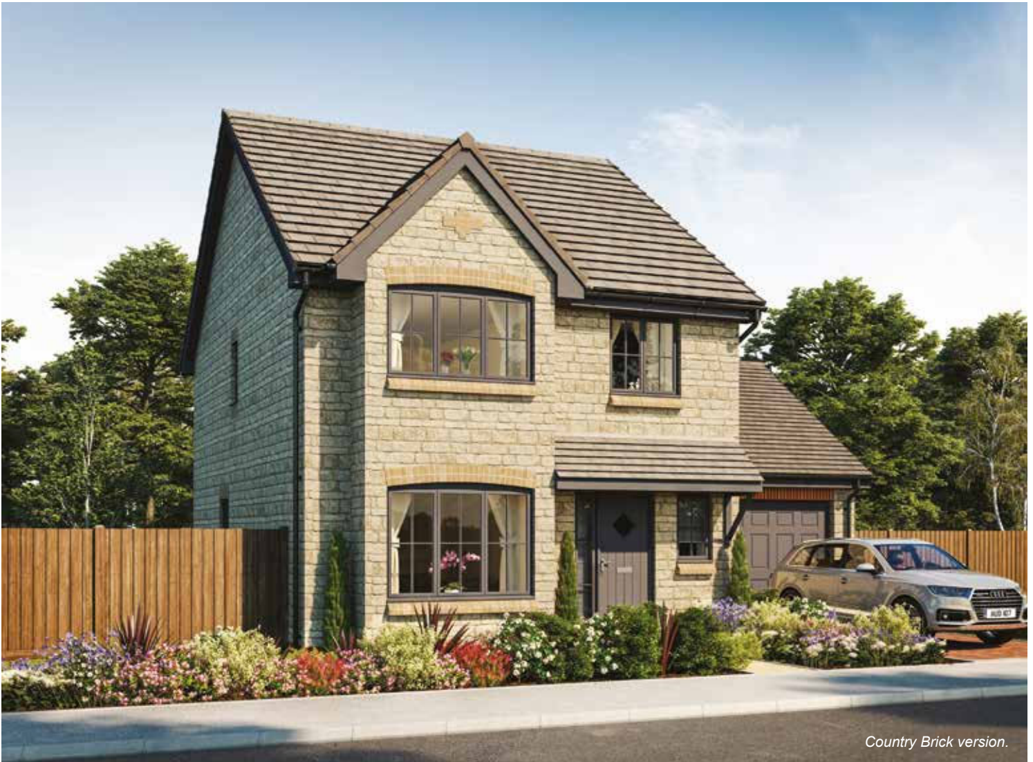
Country Brick version.