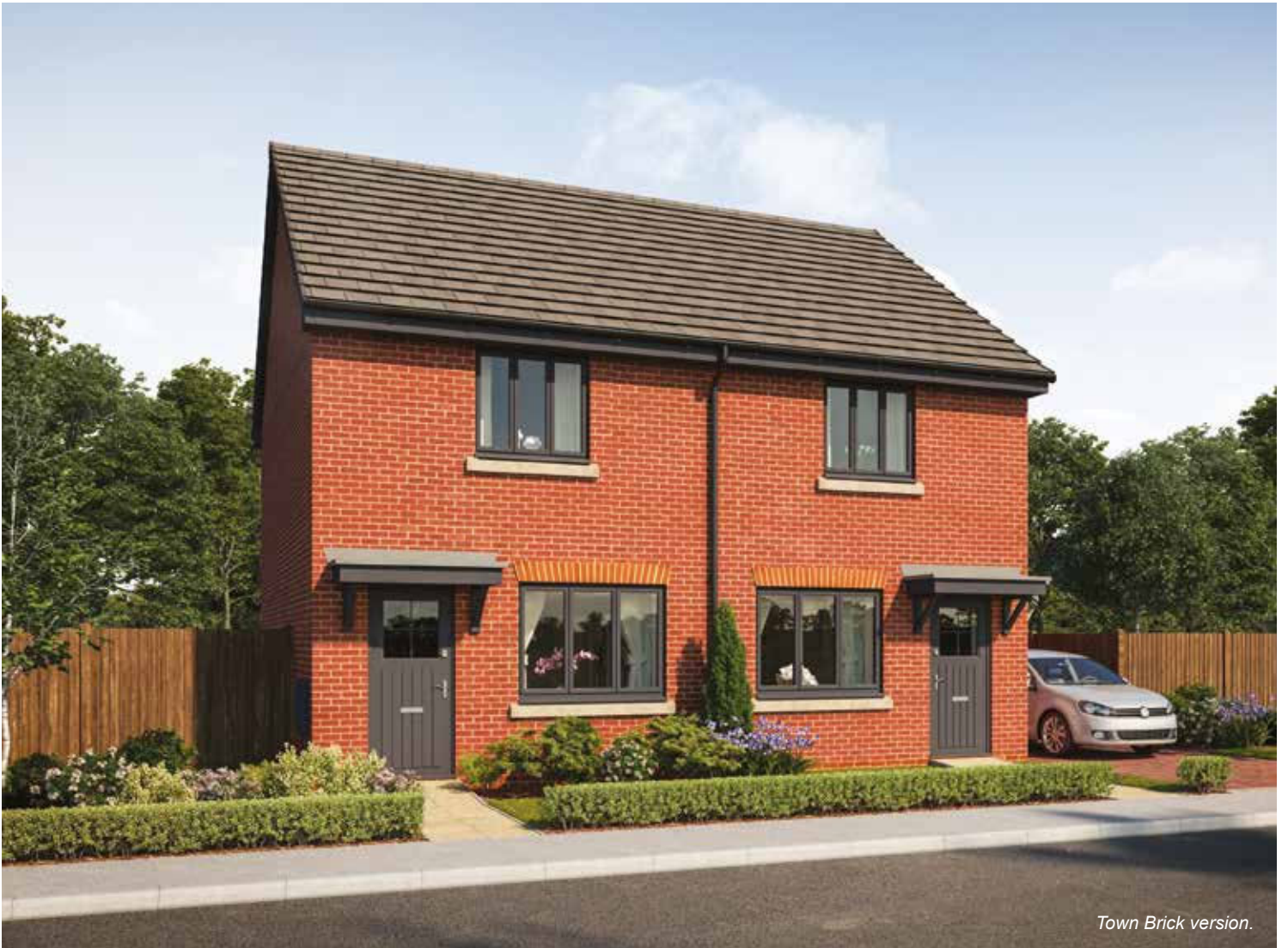
Town Brick version.