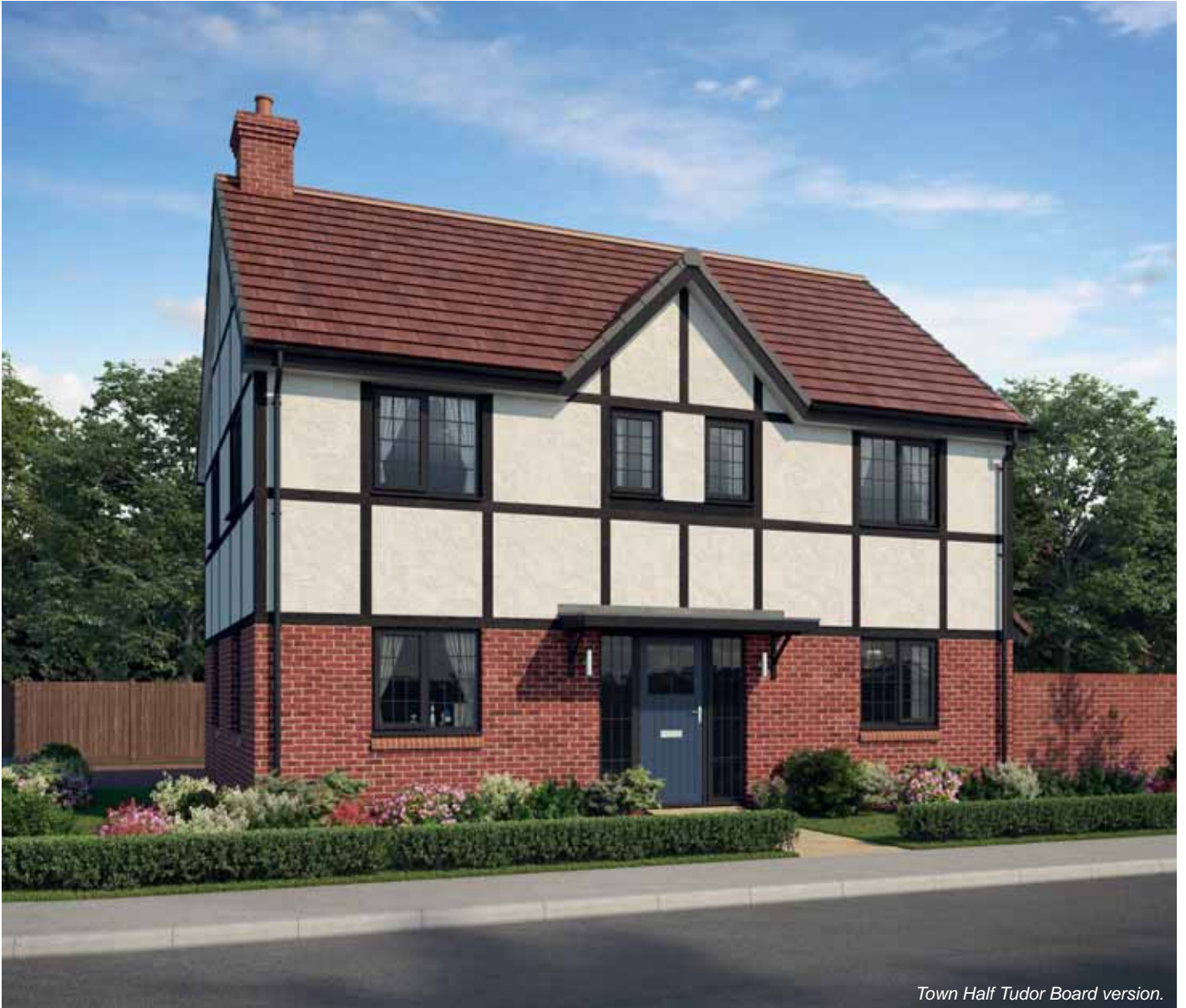
Town Half Tudor Board version.