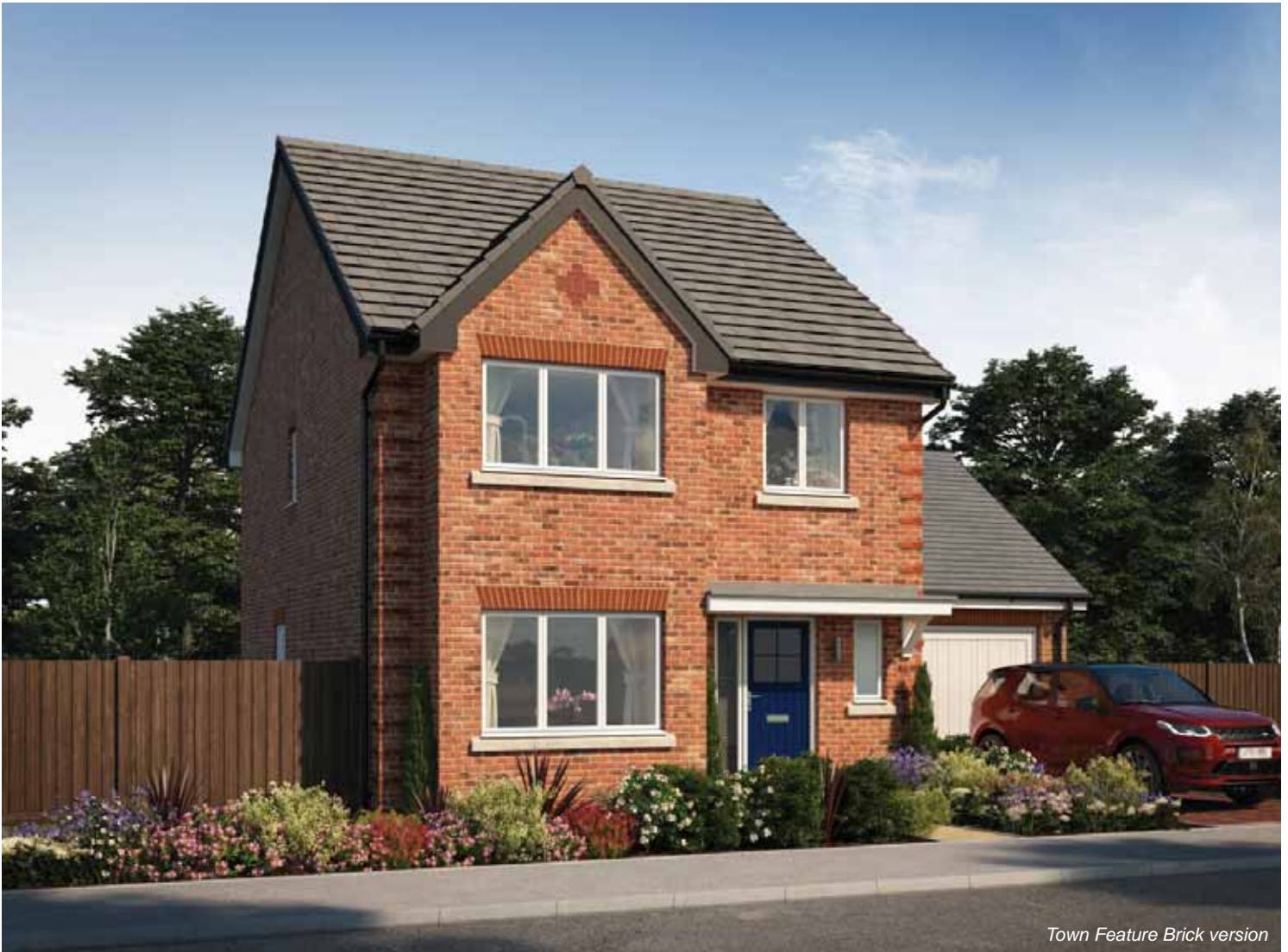
Town Feature Brick version