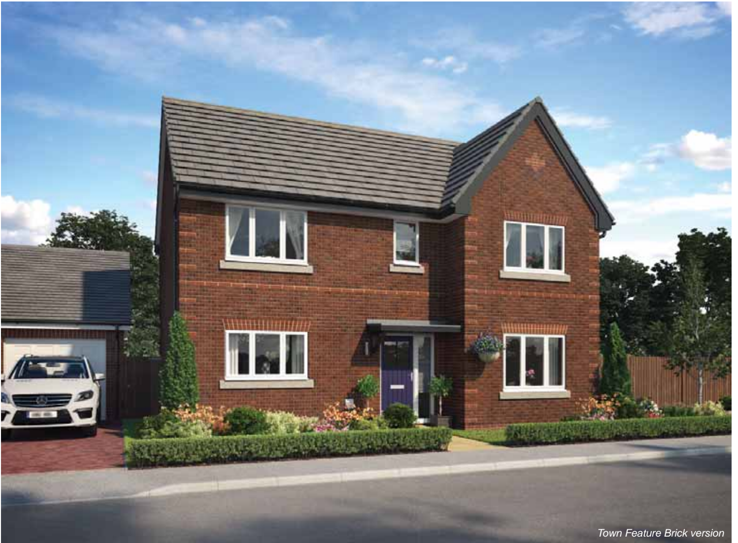
Town Feature Brick version