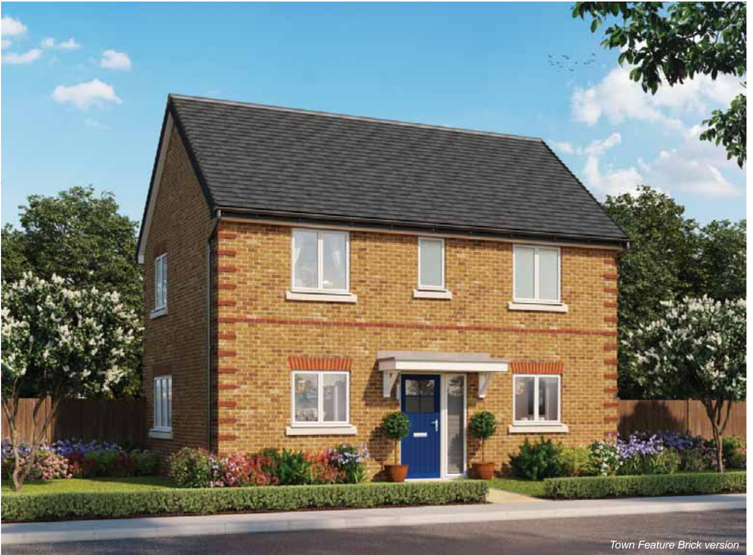
Town Feature Brick version