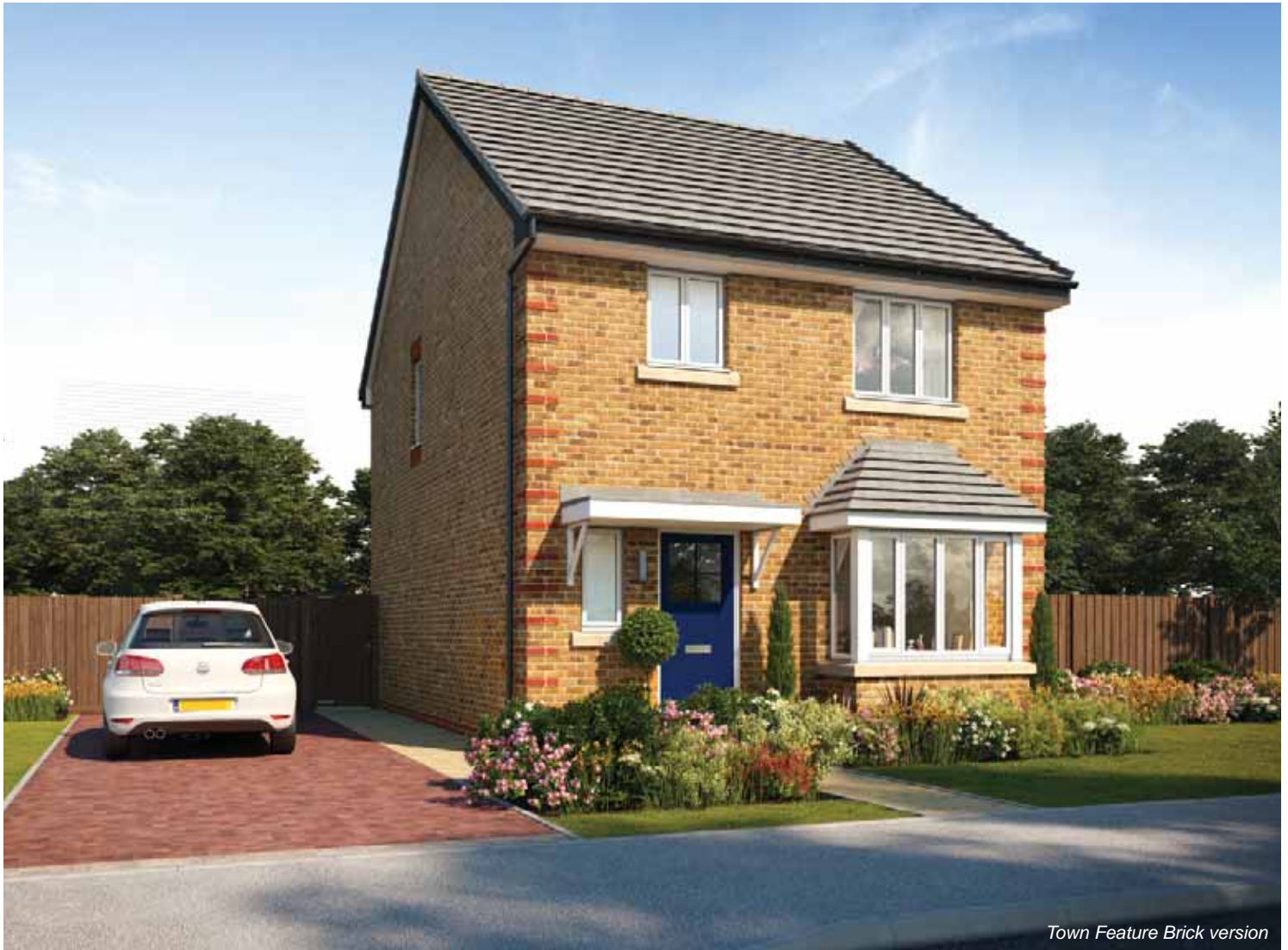
Town Feature Brick version