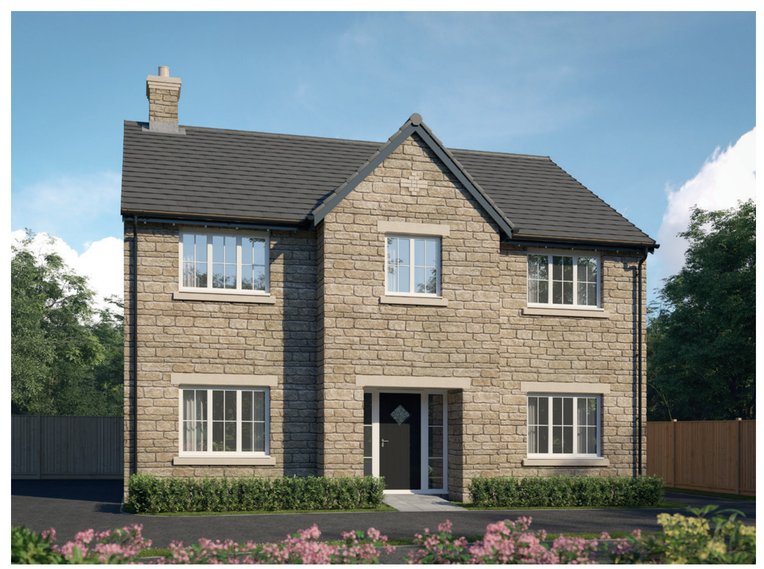
Please note: Chimneys are plot specific. Stone course may differ from shown. Please see Sales Advisor for details.